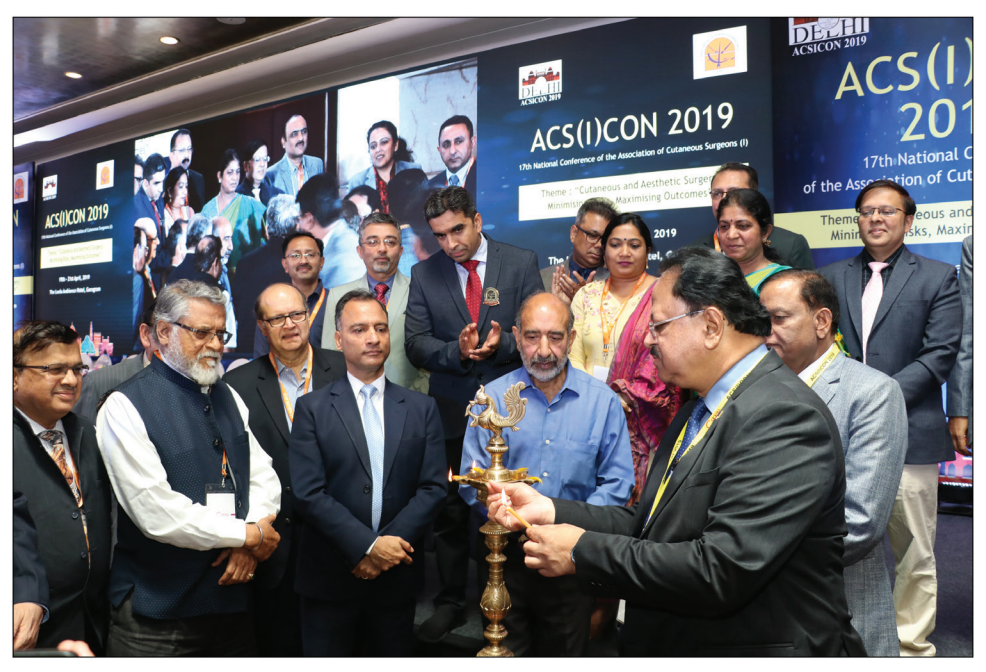
Figure 3: Opening ceremony of ACSICON 2019