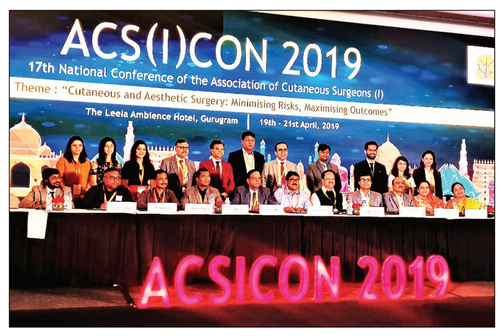
Figure 4: Valedictory session and formal closing of the conference in progress

parallel meetings of the Association of Cutaneous Surgeons (I) as well as other core groups and planners. There were devoted free paper sessions where more than 40 young researchers got to share their research findings. These are the future of dermatosurgery in India and ACSICON 2019 spared no effort in encouraging them for their hard work. On the sidelines were E-poster presentations by more than 80 young colleagues which were viewed enthusiastically, and judged proficiently for subsequent E-poster awards. Clinical studies and interesting case reports were judged as separate categories and awarded suitably. The Annual ACSI Quiz saw enthusiastic participation by 17 national teams who had cleared the zonal online rounds. They competed vigorously for selection for the quiz finals. In the end, four teams made it to the finals and team from INHS Ashwini won the quiz.