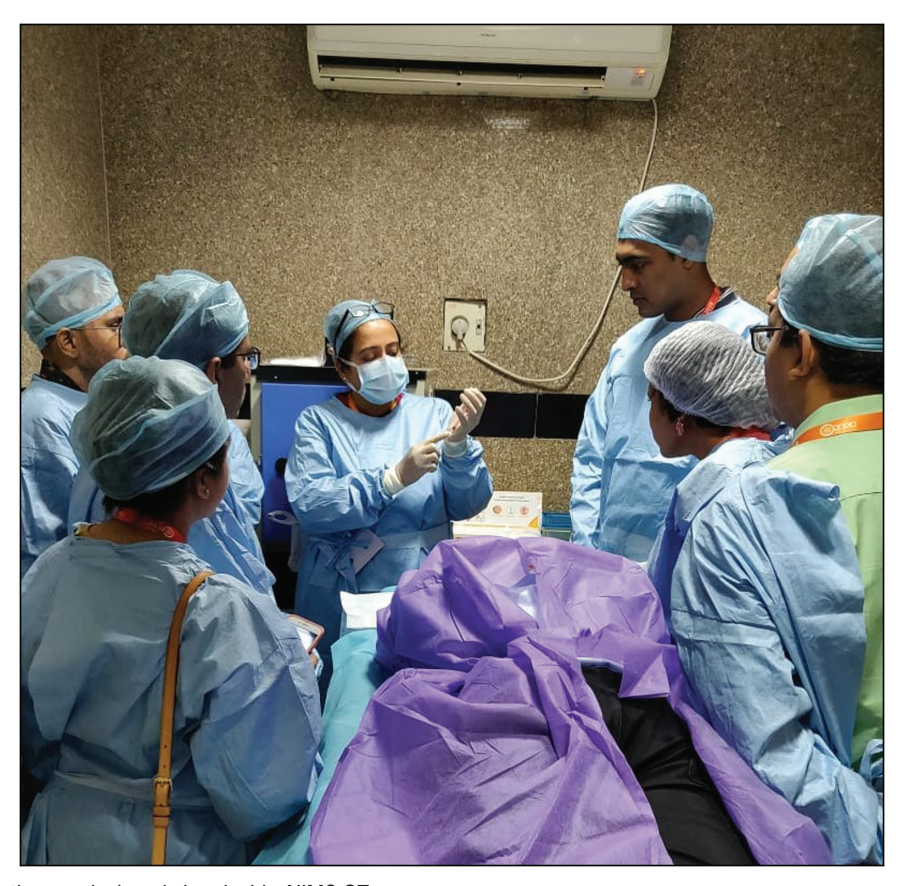
Figure 2: Live demonstration surgical workshop inside AIIMS OT