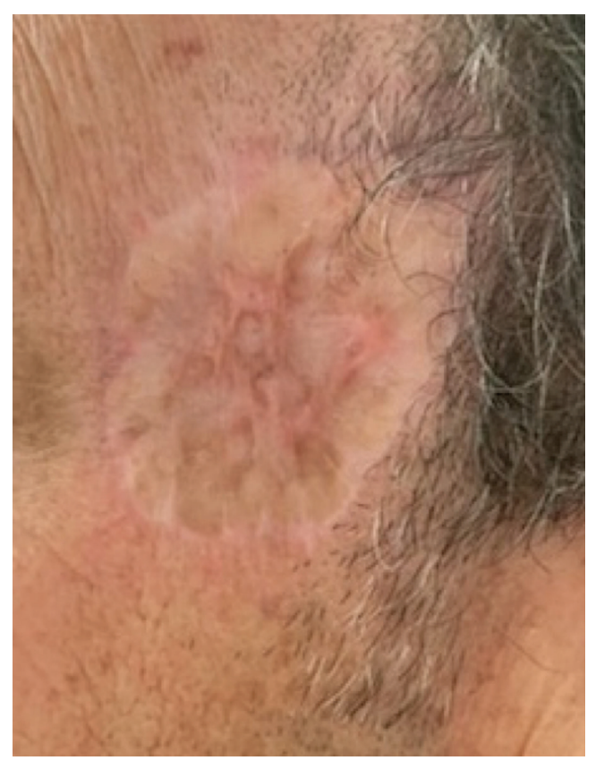
Figure 4: 100% skin graft take with no evidence of hair reoccurrence, 6 months postoperatively