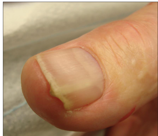
Figure 1: Lateral subungual longitudinal thickening of the nail plate

ADAVM is a rare condition occurring either as inherited or acquired type. Characteristically there is an abnormal connection between arterioles and venules of the finger fed by the digital vessels. [1,2] The most common presentation of ADAVM is small, slightly raised dark-red macules on the distal parts of fingers. The subungual