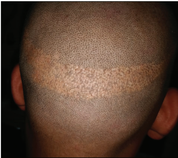
Figure 5: Overharvesting in FUE