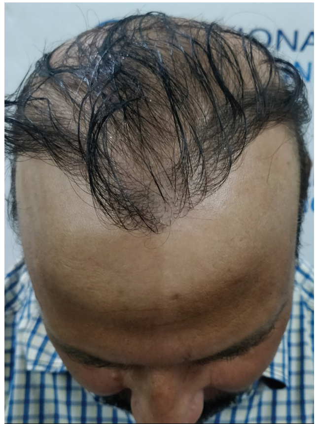
Figure 7: Unnatural hairline photo

Low-positioned hairline and blunting of the temporal angles can occur if placement is below 6cm from the glabella. It creates artificial appearance in cases with higher grades of baldness or global thinning. It can