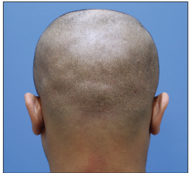
Figure 3: Pinpoint scarring