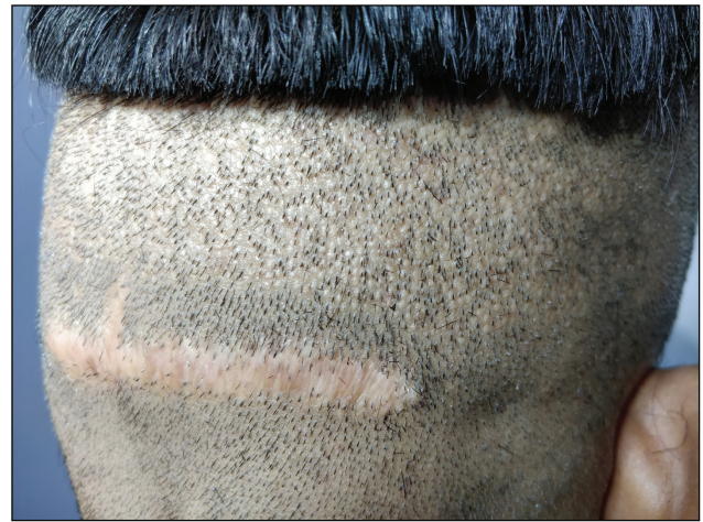
Figure 1: Wide scar after FUT

Caution is advised while closure to avoid excessive tension along incision line, especially near the area superior to the mastoid process, and in wide strips done for mega sessions. Preoperative daily scalp massage may improve scalp laxity before the surgery.