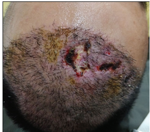
Figure 8: Central scalp necrosis

also lead to dissatisfaction of the patient over time, especially in the case of evolving progressive hair loss behind the transplanted hairline. Creating zones of variable density in a patient with a Norwood V pattern to mimic the distribution pattern of hair in someone who is a Norwood III gives a very natural result.