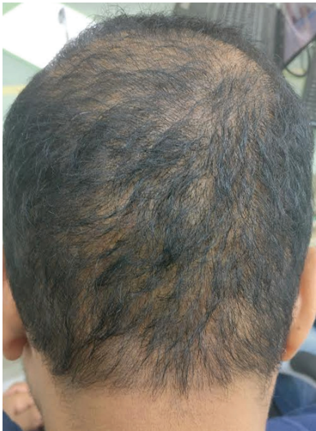
Figure 2: Donor depletion