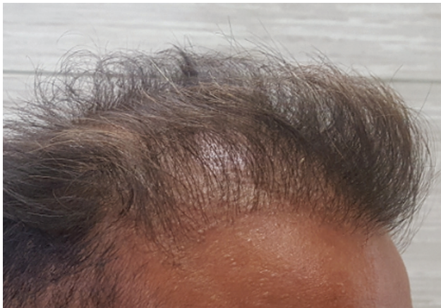
Figure 6: Cobblestoning

of incising the cysts and expressing out the contents, using warm compresses, or sometimes applying topical antibiotics.