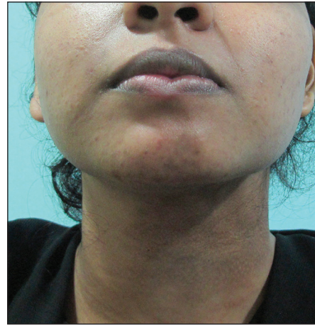
Figure 3: Circumscribed morphea- 1 week after HA filler