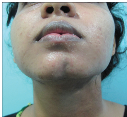
Figure 1: Circumscribed morphea with chin contour defect

The non-animal stabilised hyaluronic acid fillers (Perlane R - Q Med) were considered due to their safety, no requirement for pre-testing, large particle size, lifting and volume restoring capacity, longevity due to minimal cross-linking and ability to reverse injection with hyaluronidase when required if result is undesirable. Perlane R has a large particle size of 1000 microns and is approved for deep dermal and subcutaneous injections. The patient showed satisfactory correction of volume deformity with HA filler which was safe and effective and showed persistence for 9 months of follow-up with no signs of filler degradation. Reports claim expansion of the use of hyaluronic acid fillers to include scar atrophy, as persistence of a desired cosmetic appearance of volume restoration and appearance of the scar with sustained satisfaction 24 months after hyaluronic acid treatment, without the need for repeat injection. [8] Thraeja and Richards et al. report successful correction of en coup de sabre and linear morphea with HA fillers, [5,8]