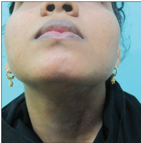
Figure 4: Persistence of filler injected for subcutaneous atrophy in morphea at 9 months post-treatment