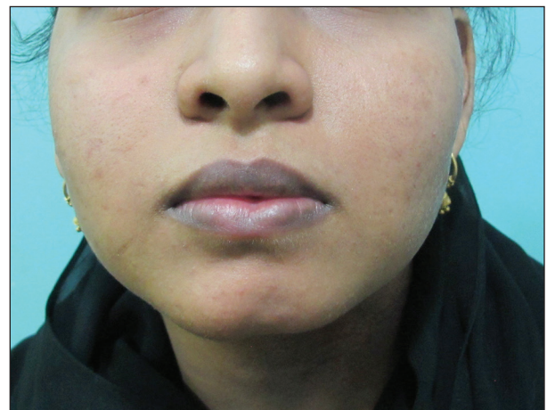
Figure 5: Persistence of filler at 9 months post-treatment done for morphea-induced chin contour defect

whereas Onesti reported the results were found to be upto 12 months in four patients with linear scleroderma treated with poly-L-lactic acid (PLLA). [7]