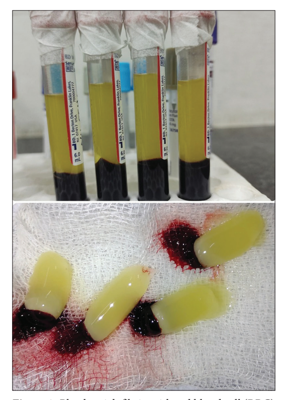
Figure 2: Platelet-rich fibrin with red blood cell (RBC) tail. This platelet-rich fibrin (PRF) is placed on the wound and dressing is done.

The treatment of MCD depends on the severity of the involvement and single lesions can be treated with topical intralesional corticosteroids. Systemic treatment options include oral glucocorticoids, oral metronidazole, immunosuppressant such as methotrexate, cyclosporine, azathioprine, and tumor necrosis factor- \alpha inhibitors such as adalimumab and infliximab. Hyperbaric oxygen has also been tried in the management.4 Platelet-rich plasma (PRP) is an autologous blood product and PRP injections have been used for the management of fistula and were found to be effective.5 PRP releases many growth factors and helps in wound healing. PRF is a second-generation autologous blood product. It is simpler to prepare, does not require anticoagulants, and does not need to be injected