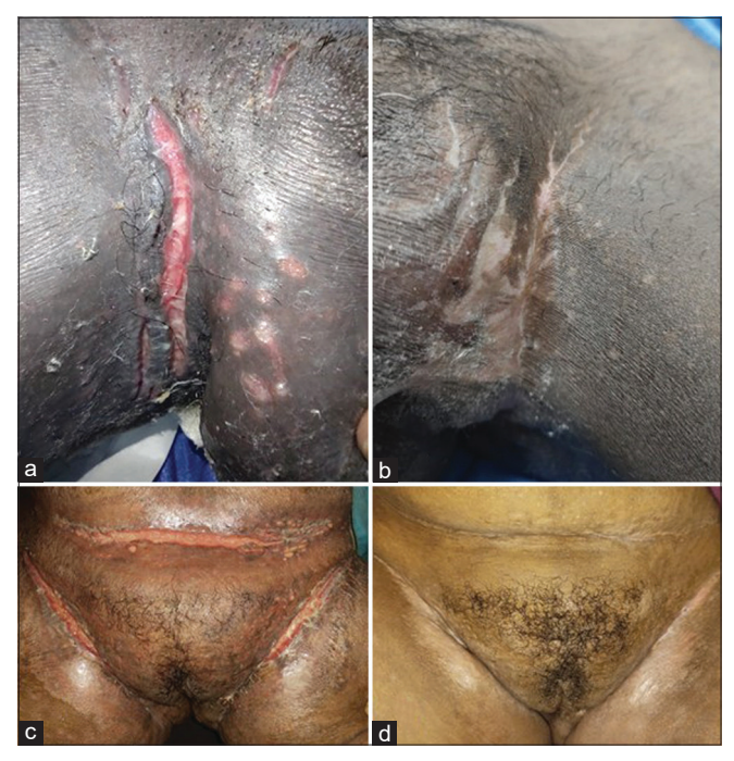
Figure 3: (a) Knife-cut ulcer in groin fold. (b) Complete healing of ulcer after weekly sessions of platelet-rich fibrin (PRF) after 4 weeks. (c) Knife-cut ulcer in suprapubic region. (d) Complete healing seen after weekly PRF after 3 weeks.

as PRP. Unlike PRP, it releases growth factors slowly and acts as scaffolding for better wound healing.<sup>6,7</sup> To the best of our knowledge, PRF has not been used earlier for the management of MCD. It is a safe and effective adjuvant in the treatment of this difficult disease.