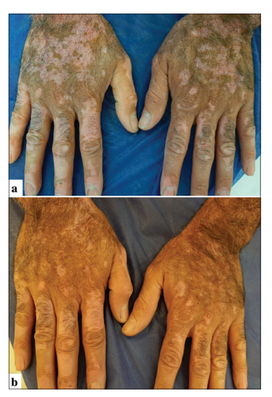
Figure 3: (a) Clinical photographs of a 56-year-old male with refractory vitiligo lesions on both hands before treatment and (b) 6 months after the final treatment session. The patient's right hand treated with a combination of fractional carbon dioxide (FCO<sub>2</sub>) laser, excimer lamp therapy, and platelet-rich plasma demonstrates >75% repigmentation. The patient's left hand was treated with a combination of FCO2 laser, excimer lamp therapy, and topical tacrolimus 0.1% shows between 50% and 75% repigmentation.

In a similar clinical trial, Wen et al. compared the efficacy of the triple combination of FCO2 laser (3 monthly sessions), excimer lamp (twice weekly), and topical tacrolimus for 6 months with a double combination of excimer lamp and topical tacrolimus. Good-to-excellent