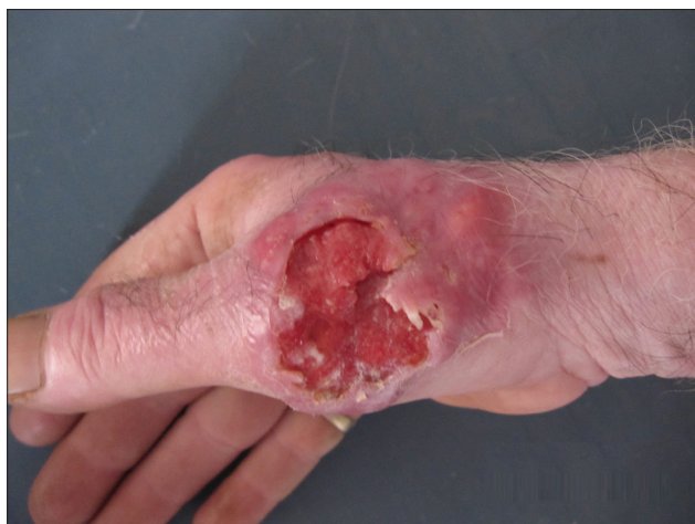
Figure 1: An exophytic growth, 4 cm across, present over the dorsal aspect of the right hand, adhered to the underlying subcutaneous tissue. The surface of the growth was marked by ulceration in the centre