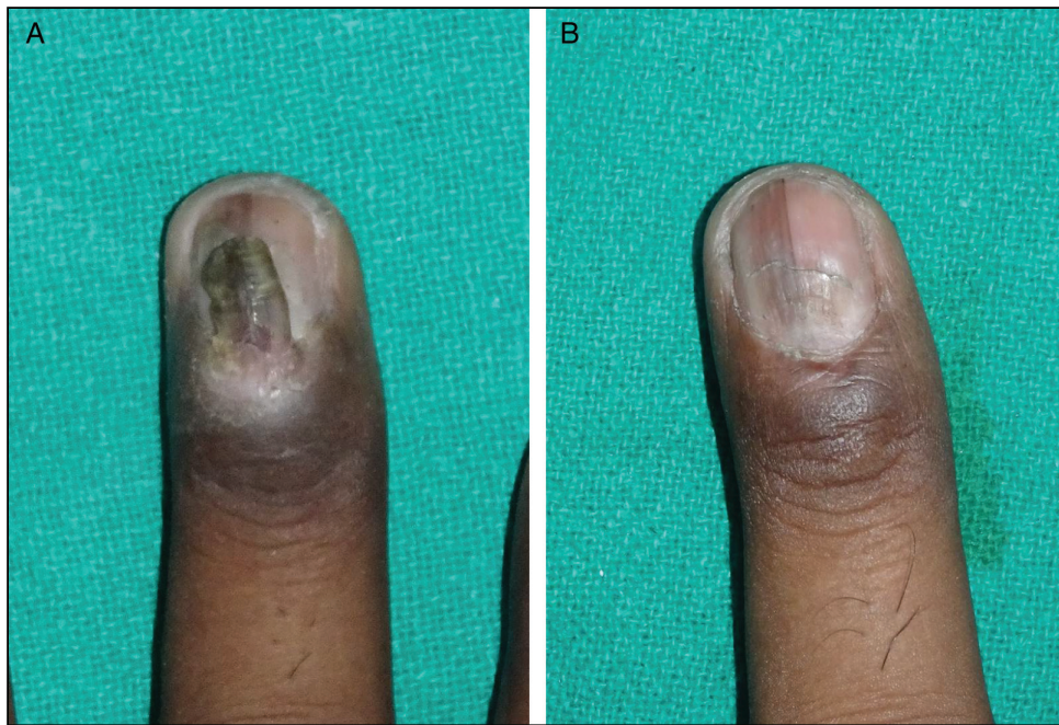
Figure 1: (A) A deformed ectopic nail arising over a normal nail plate. It was arising from a well-formed pocket within the PNF. The ectopic nail shows discoloration and the underlying plate shows a slight depression. (B) Postoperative outcome at the end of 8 weeks, with a normal but slightly retracted PNF. Note the slow normalization of the nail plate curvature