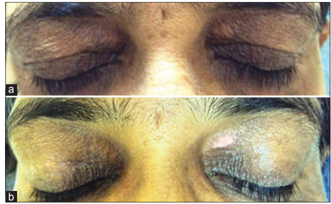
Figure 3: (a) Macular type of xanthelasma palpebrarum distributed over upper eyelids bilaterally. The right eye lesions were treated with 30% trichloroacetic acid application and left eye lesions were treated with radiofrequency ablation. (b) Score of 4 on right eye at 4 weeks and left eye lesion has healed with hypopigmentation

The small sample size is a limitation of this study; however, a good number of lesions were treated and the effects were similar in all the lesions. This study was conducted as there