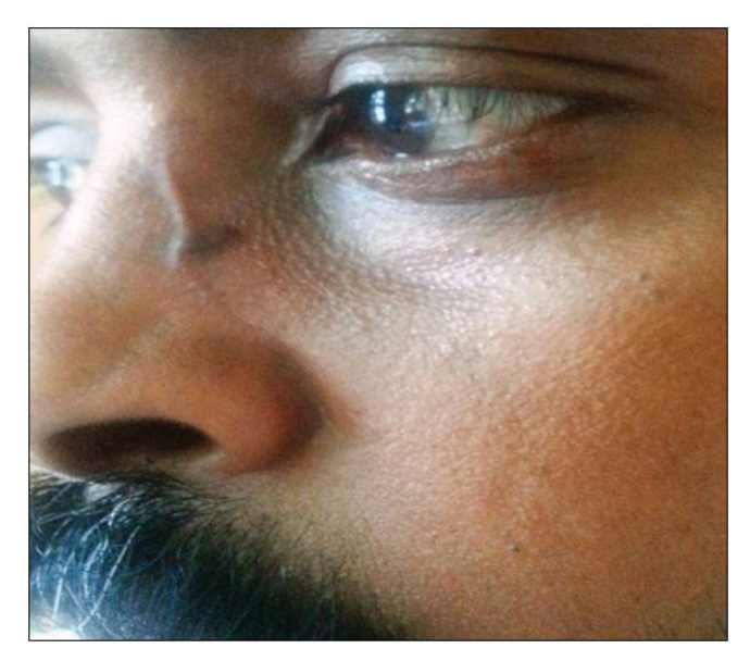
Figure 9: Recurrence following BCC excision