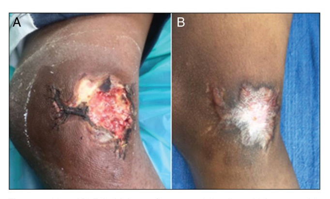
Figure 4: (A and B) Full-thickness flap necrosis healing with hypertrophic unacceptable scar

Flaps for facial reconstruction around orifices have to be meticulously planned. Defect closure around nose, eyelids, and lips are particularly susceptible to this distortion. Achieving a tension-free closure is fundamental to avoid this complication. As the wound heals flap contracts thus exerting pulling effect on adjacent structures. In our study, flap for large lesion near to lower eyelid excision resulted in ectropion [Figure 7] which was referred to a oculoplasty surgeon. Any lesion within one cm of the orifices flap