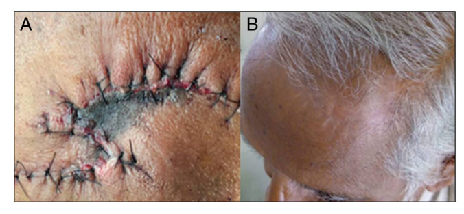
Figure 2: (A) Tip necrosis in double rotational flap due to acute angle of rotation. (B) Very well healed scar following superficial tip skin necrosis

Haematoma is another common cause of flap necrosis. Control of hypertensive status, achieving good haemostasis during surgery and compression dressing, restriction of