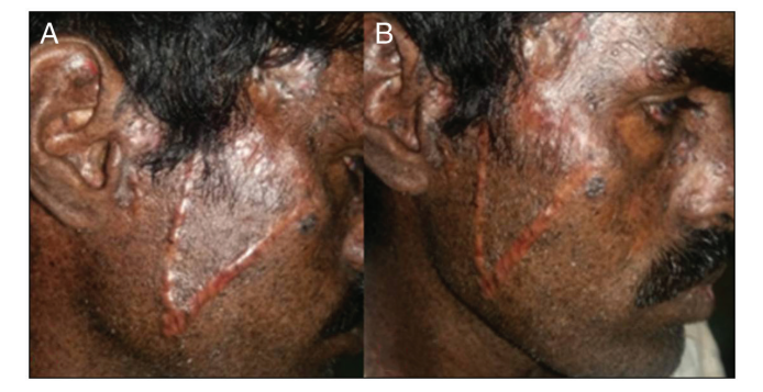
Figure 5: (A and B) Hypertrophic scar managed with three sittings of intralesional steroid