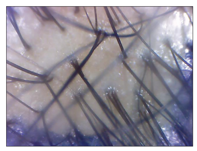
Figure 2: Post-treatment trichoscan image

One hour prior to administration of PRP, anaesthetic cream was applied over the bald area. Area of the scalp to be treated was cleaned with cetavlon, spirit and povidone-iodine. With the help of insulin syringe PRP was injected over affected area by nappage technique (multiple small injections in a linear pattern one-