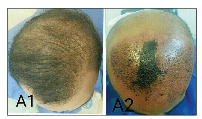
Figure 1: A1: A 34-year-old man, with untreated androgenetic alopecia A2: Two days after undergoing a dense hair transplantation procedure, the patient developed a large eschar on the vertex and right parietal region of the scalp

Follicular transplantation into regions of scalp scars is difficult. [1,2] Several reports document the underlying