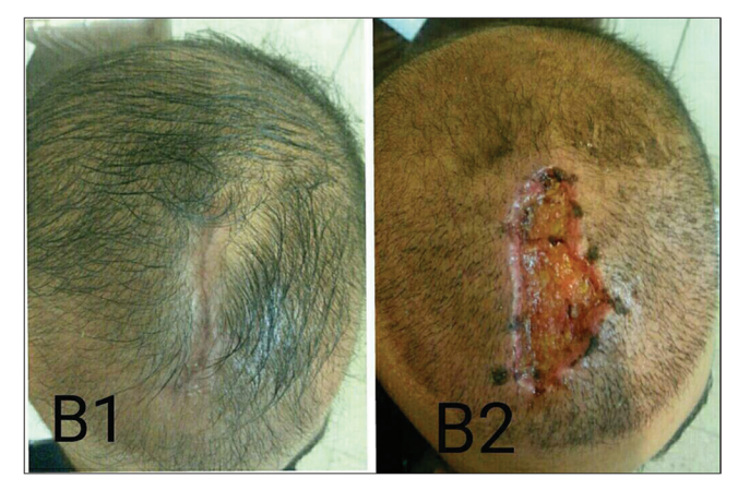
Figure 2: B1: After two weeks of the lesion topical care, the eschar naturally exfoliated, leaving a large wound extending into the dermis. B2) The complete wound healing was achieved after five months of treatment

importance of improved local blood flow via tissue debridement or hyperbaric oxygen therapy, before performing dense hair transplantation. In a previous study, we described an "ischemia timeline," toward aiding clinicians to avoid scalp necrosis. Dense slitting commonly causes cutaneous ischemia (i.e., primary ischemia). After the initial scalp insult, the skin begins to reperfuse until engraftment during the "reperfusion time," which induces a secondary ischemia. On the basis of this data, we demonstrated by Feily's method that increasing the reperfusion time results in increased regional blood flow, thereby protecting against scalp necrosis and transplant failure.