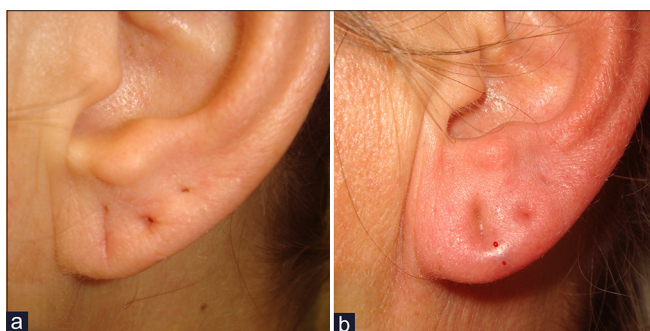
Figure 1: (a, b) A 46-year-old female patient with loss of volume and fine wrinkling of the ear lobe. Rejuvenation with hyaluronic acid filler treatment. (a) Before treatment. (b) After filler injection reduced wrinkling and increased fullness.

Fat injection and fillers are effective, minimally invasive techniques for restoring earlobe volume and enhancing a youthful appearance. Fat transfer uses autologous fat harvested from donor sites such as the abdomen, thighs, or submental region, which is processed and injected in small amounts into the central body, medial, and lateral edges of the earlobe. This approach provides natural, long-lasting results, improves skin quality through adipose-derived stem