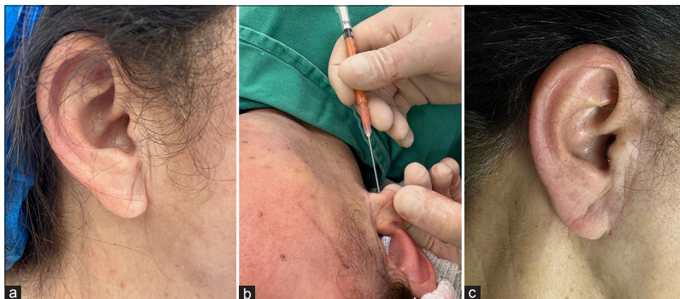
Figure 2: (a) Atrophic and wrinkled earlobe. (b) Fat grafting into the earlobe during rhytidoplasty. (c) Result 3 months after the procedure.