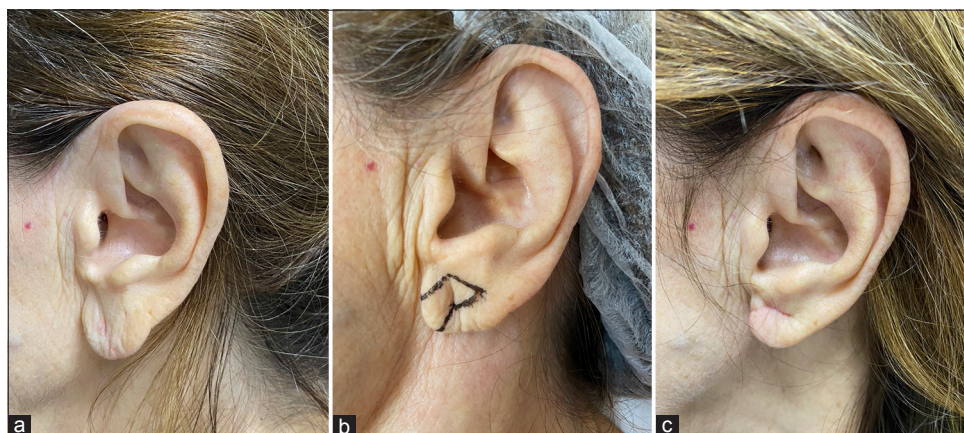
Figure 3: (a) A 61-year-old patient with ptosis and stretching of the earlobe. (b) Surgical planning. (c) Result 1 month after surgical procedure.