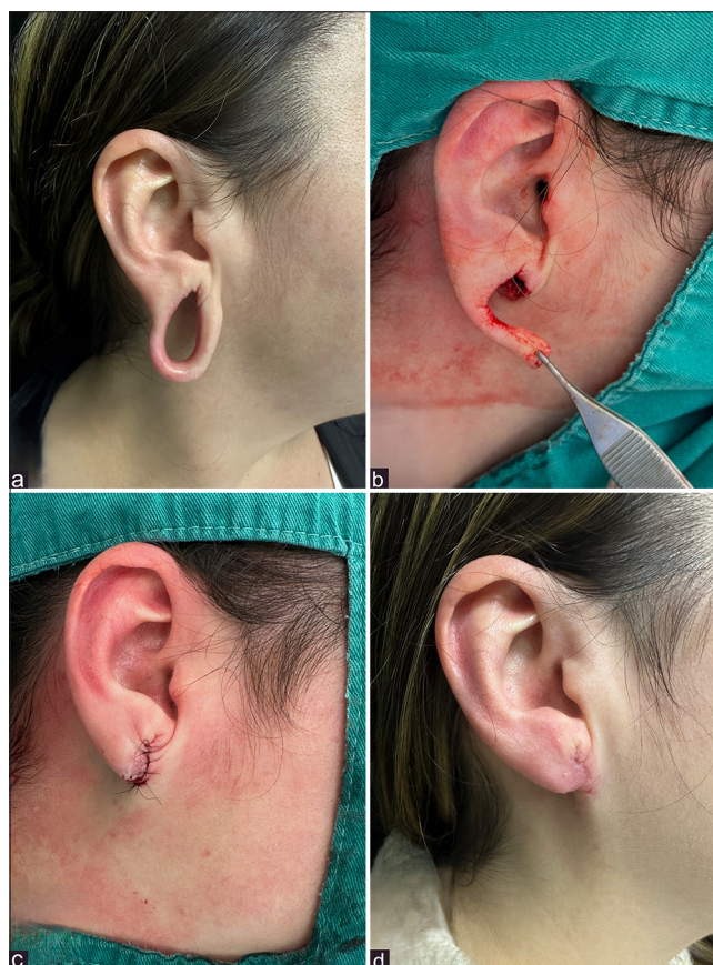
Figure 5: 34-year-old patient, who has been using (a) earlobe gauging (rings) for 20 years. (b) Preparation of a local flap, de-epithelization of the inner rim of the hole. (c) Flap positioned and sutured. (d) Result 1 month after surgery (Henderson-Malata technique).

TCA peels are chemical agents used to resurface the skin and stimulate collagen production. They are effective for mild surface irregularities and wrinkles, helping improve the texture and appearance of the earlobe. However, precise application is critical to avoid overexposure, which may lead to burns or scarring. 46