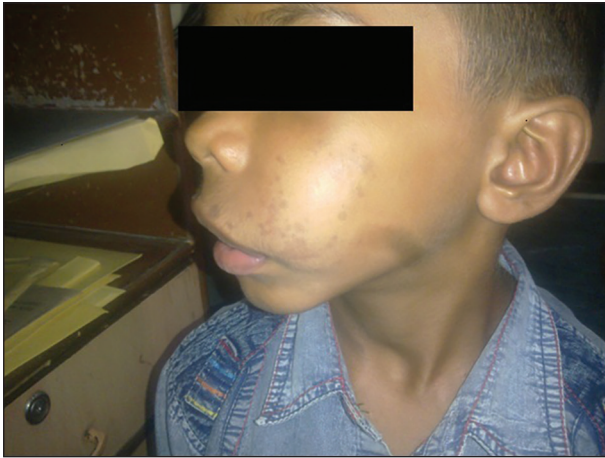
Figure 1: Large diffuse swelling seen on the left lower face involving left cheek and upper lip

Numerous nerve bundles, few of them showing myxoid change were also seen [Figure 2]. However, no arteries or arterioles were seen and vessel wall was negative for elastic tissue (Verhoffs stain). Based on the clinical details and histopathological findings, a final diagnosis of angiomatosis was given.