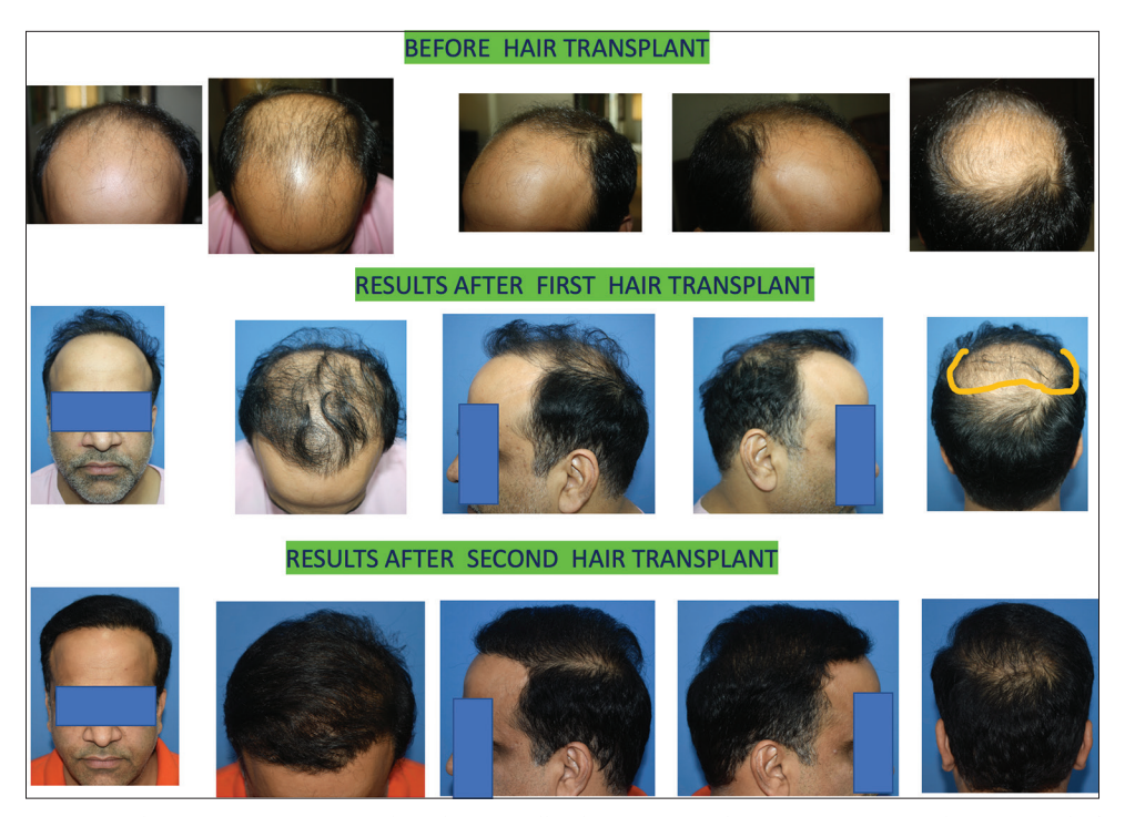
Figure 5: This young man Norwood grade VII. Follicular unit transplantation (FUT) was done. A total of 3506 grafts were implanted. After six years of primary hair transplant, a total of 4550 grafts were harvested, 2526 from the scalp by follicular unit extraction (FUE) and 2024 from the beard. The anterior hairline was revised, and mid-scalp and upper crown, including side parietal eminence areas, were transplanted. After ten months of hair transplant, the results showed good coverage, except lower crown area.