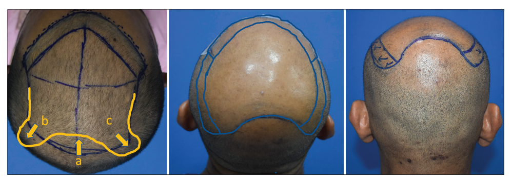
Figure 3: Modification to cover posterior parietal area by extending posteriorly laterally in areas "b" and "c." The final area looks like a heart shape.

The esthetics of the face lie in maintaining the proportion of one body part to another, bilateral symmetry, and contour of the face and scalp.<sup>2,8</sup> The AHL, temporal fringe, maintains the framing of the face and proportion of facial parts, while the hair volume maintains the contour of the scalp all around the scalp.<sup>11</sup>