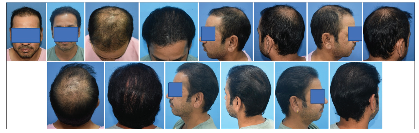
Figure 4: This young man had hair loss and thinning in the front, mid-scalp and crown. A total of 5256 grafts were implanted in two days. On day one, three thousand thirty grafts were harvested from the scalp and 2226 grafts from the beard on the second day. Front, mid-scalp, including parietal eminence (posterior parietal triangle), were transplanted. After eight months of hair transplant, the results showed good coverage over parietal eminence.