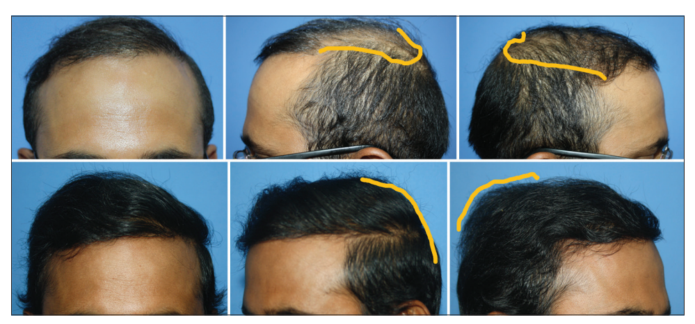
Figure 6: This young man had Norwood grade VI baldness. Some surgeons implanted approximately 2500 follicular unit transplantation (FUT) grafts. However, the patient was concerned about thinning in the part line and parietal eminence area, which were quite noticeable in oblique and lateral profile. We implanted 5023 grafts from the scalp and beard, covering the parietal area and part of the crown. The results are after 13 months of hair transplant.

In balding males due to AGA, there is receding of the AHL, followed by temporal area recession and loss of hair bulk in the parietal and crown area. The restoration of the AHL is the first priory of hair restoration, followed by mid-scalp and, lastly, the crown. Thinning and loss of hair in the parietal and crown area leads to loss of scalp contour, leading to compromised esthetics.