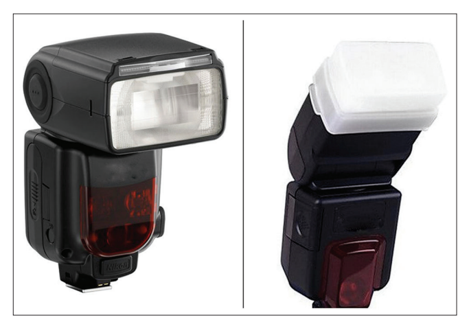
Figure 3: A speedlight (left) and a speedlight with a diffuser over the light (right) that softens the harsh bright light retaining facial features