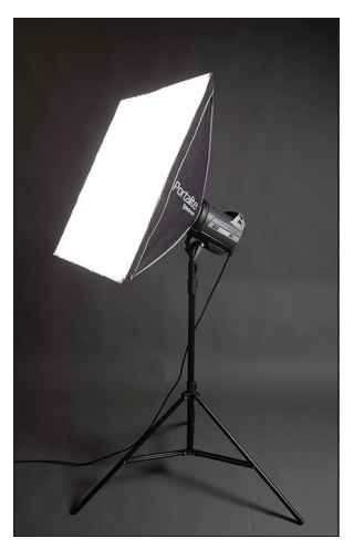
Figure 2: A typical softbox. The lights within are called strobe lights and are closest to natural day light in terms of colour temperature

The background should be an even, neutral, nonreflecting, monochromatic surface. The preferred background