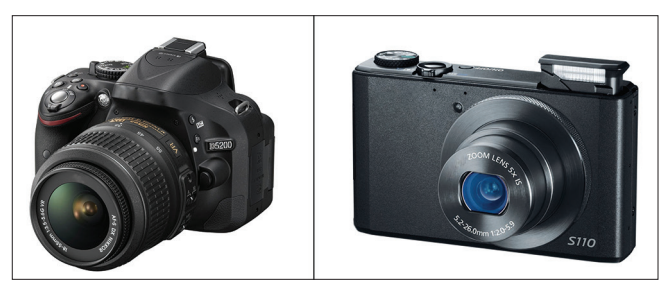
Figure 1: Types of cameras – a digital single lens reflex (left) and a simple point-and-shoot camera (right)

Depending on the requirement, D-SLRs allow different lenses to be affixed to the camera body. These lenses are