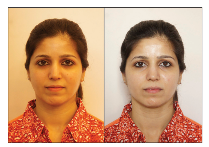
Figure 4: Two different photographs of the same subject. The photograph on the left is shot with no additional lighting and with ambient room light. The photograph on the right is shot with softboxes. Observe the difference in the skin tone and exposure and the masking of the tear trough deformity in the photograph on the left