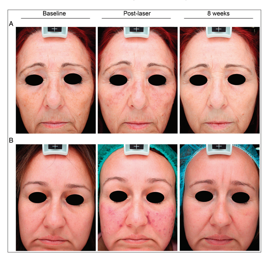
Figure 3: Standardized facial photographs of patients during the study at baseline, just after the laser treatment and at the end of the follow-up period