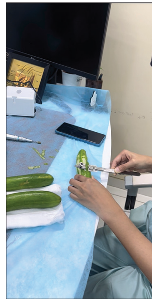
Figure 2: Demonstration of the process of skin grafting on a cucumber.

in a simplified manner, offering a practical simulation for training purposes.