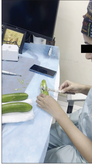
Video 1: Demonstration video.

removing this layer, while the underlying white flesh mimics the dermis. Figure 2 and Video 1 demonstrate the process of skin grafting on cucumbers. Additionally, for skin grafting, thin slices can be precisely extracted from the cucumber, replicating the process of harvesting grafts. This organic model thus provides a practical, affordable, and anatomically relevant tool for skill development in dermatologic procedures.