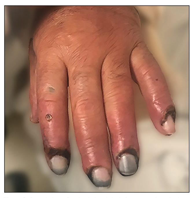
Figure 2: Dorsal view of patient's hand depicting cyanosis and edema of the digits, as well as necrosis of tissue at the nailbeds. Peripheral ulceration is noted circumscribing the areas of infarcted skin, as well as a punctate ulcer on phalanx II

injection wounds along the extremity in the habitual drug user, as well as distal ischemic skin changes to the hand and fingers in association with coolness, edema, motor and sensory deficits, and an altered distal pulse examination.