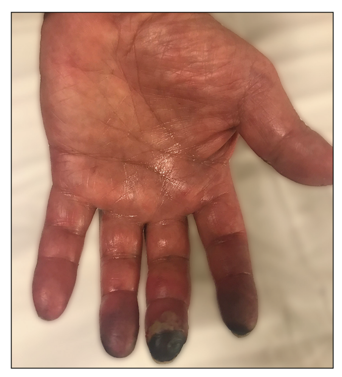
Figure 1: Volar view of patient's hand depicting ischemic skin changes. Note the distal cyanosis and edema of phalanges II–IV, as well as the appearance of dry gangrene indicating cutaneous infarction