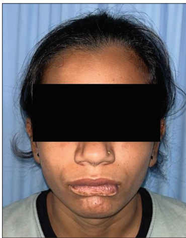
Figure 1: Pre-operative photo.

The lip is a rare site for AV malformation. Treatment modalities include sclerotherapy, pre-operative embolization, and surgical resection. 3 However, these managements can have complications and cause disfigurement of facial landmarks and hemorrhage, which makes their management difficult. The lip is a specialized tissue comprised of keratinized stratified squamous epithelium that overlies a highly vascular bed of tissue that