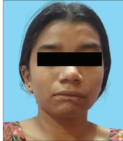
Figure 8: Clinical photographs after two and a half years of surgery.