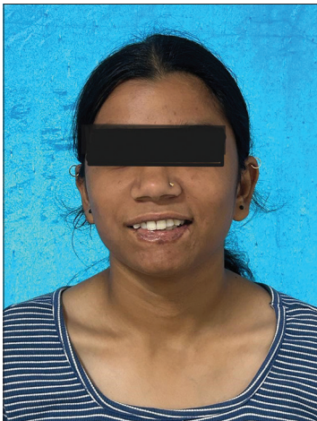
Figure 7: Post-operative lower lip (after two-year follow-up).

gives the lips their rosy hue. 4 The end goal of reconstruction is a cosmetically appealing lip. Lip augmentation has been described earlier by autologous fat grafting to reconstruct. 5 In our case, we have combined reconstructive and esthetic domains in a single stage to give a natural and esthetically pleasing lip [Figure 6].