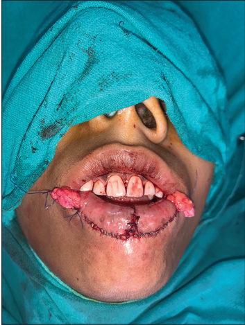
Figure 5: Dermofat threaded into the tunnel under mucosal advancement flap