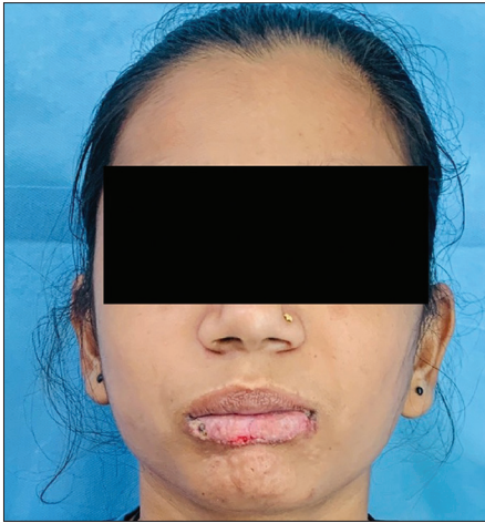
Figure 6: Clinical photograph after 6 months post-operatively.