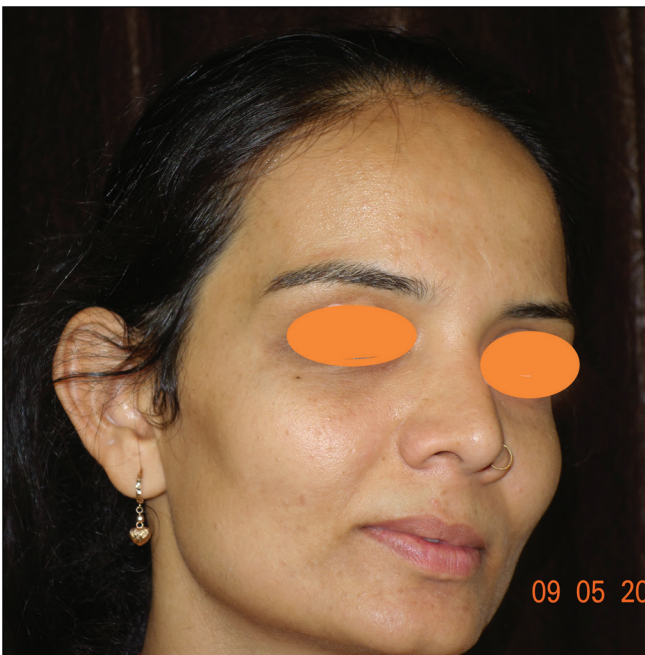
Figure 2: Side view of the face showing lentigo over right cheek