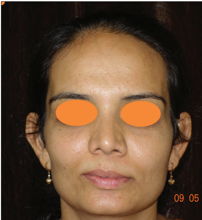
Figure 1: Front view of the face showing the lentigo over the right cheek