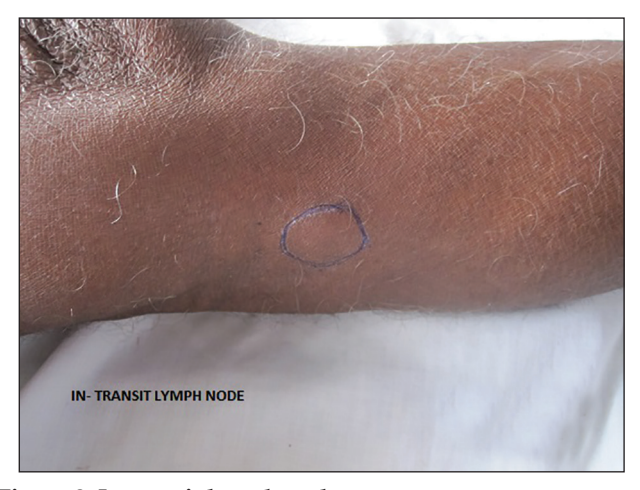
Figure 3: In-transit lymph node

Desmoplastic melanoma is classified as pure desmoplastic melanoma and mixed desmoplastic melanoma based on the degree of desmoplasia present in the tumour. More than 90% of the desmoplasia occurs in pure desmoplastic melanoma, whereas, less than 10% of the desmoplasia occurs in mixed desmoplastic melanoma. The classification of desmoplastic melanoma is important for its clinical, therapeutic, and prognostic significance. Pure desmoplastic melanoma is associated with better survival and fewer regional