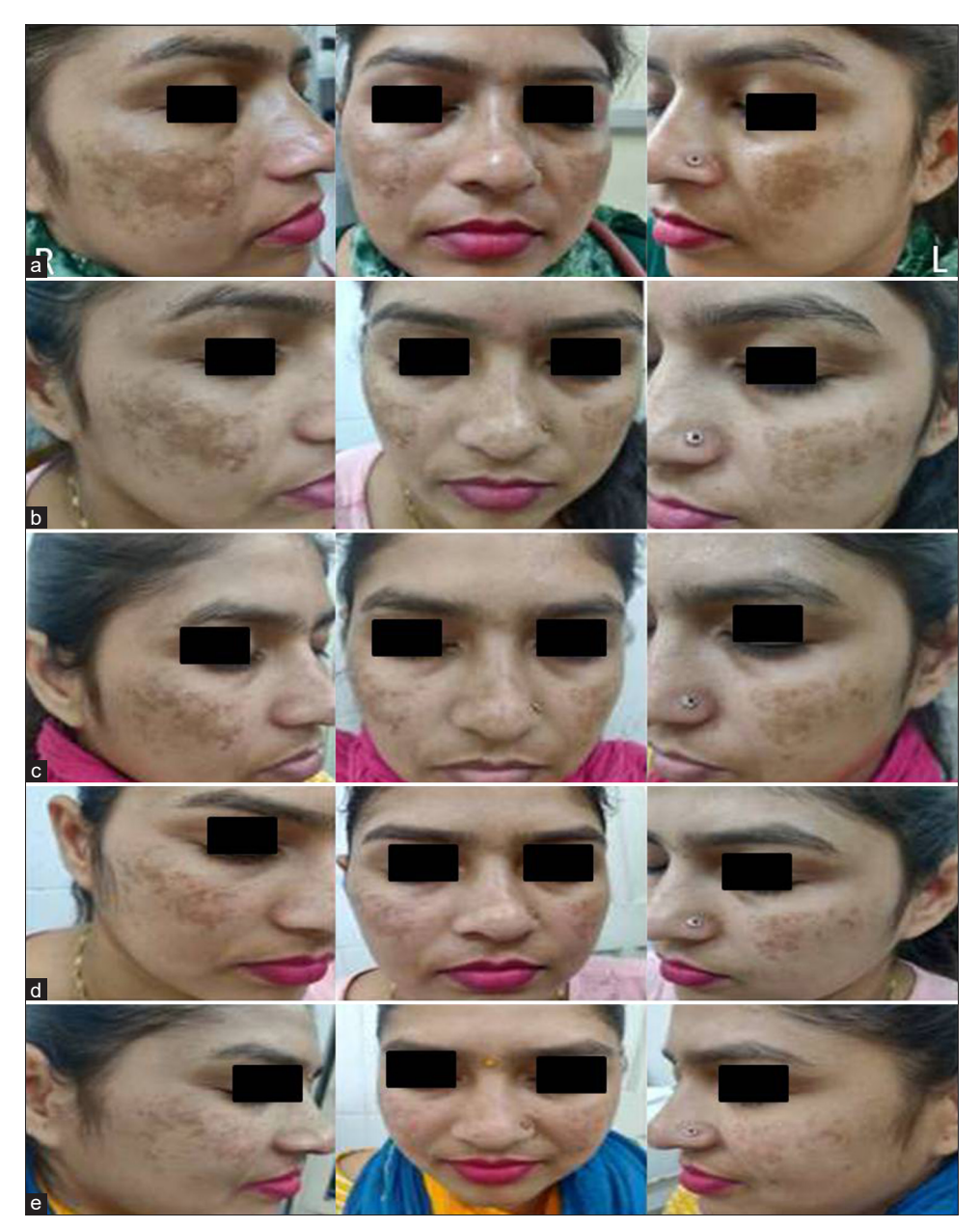
Figure 2: (a) Pre-procedure image. (b–e) Results after glycolic acid (GA) peeling on the left side and low-fluence Nd:YAG laser on the right side. Nd:YAG: neodymium-doped yttrium aluminium garnet

GA peel [Table 7]. The most common side effect observed with both treatments was erythema in 7 patients (8.7%) with laser and 8 patients (10%) with GA peeling [Figure 3]. This was followed by stinging sensation in 2 patients (2.5%) with laser and 6 patients (7.5%) with GA peeling. In patients treated with GA peel, one patient developed localized swelling on the face, while two patients developed postinflammatory hyperpigmentation [Figure 4]. Delayed side effects were not seen with GA peeling therapy, but one patient developed hyperpigmentation after 1 month of 2^{nd} session of laser treatment.