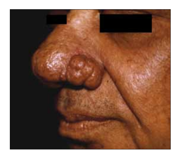
Figure 5: Pre-treatment photograph of rhinophyma

persistent erythema, and prolonged healing. The most severe complications are hypertrophic scarring,