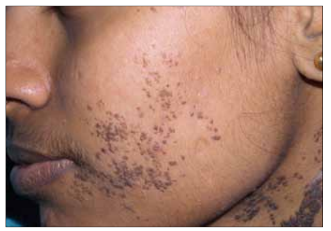
Figure 9: Verrucous epidermal nevus involving left cheek and neck