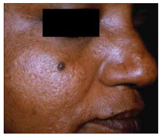
Figure 3: Melanocytic nevi before laser