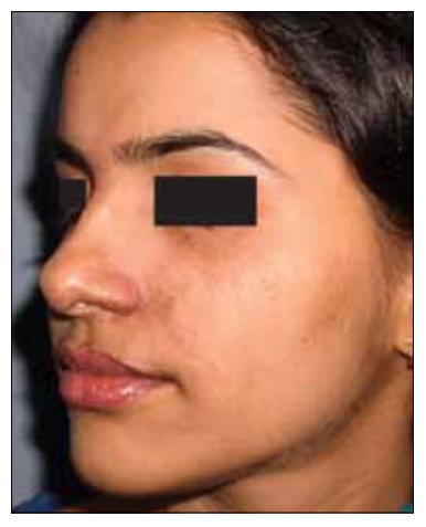
Figure 8: Significant reduction in pigmentation due to Beckers melanosis after laser