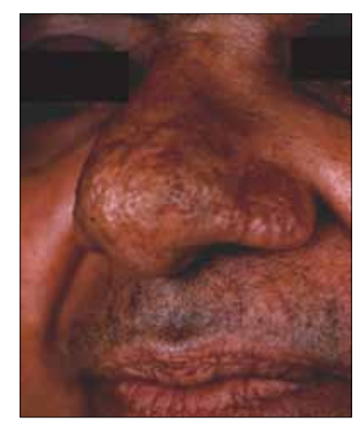
Figure 6: Laser ablation of rhinophyma has healed well with mild residual surface irregularity

persistent erythema, and prolonged healing. The most severe complications are hypertrophic scarring,