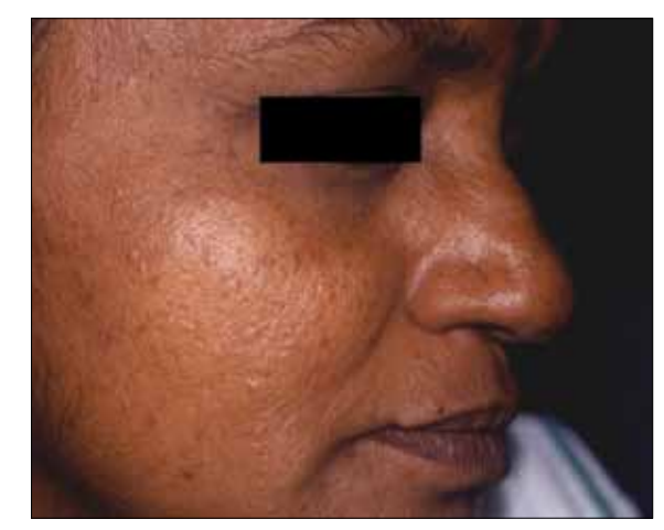
Figure 4: Melanocytic nevi has healed without scarring after laser