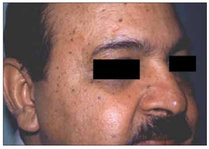
Figure 13: Multiple, brown-black papules of Dermatosis papulosa nigra on face