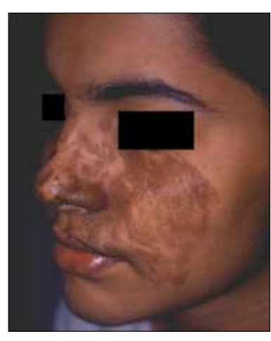
Figure 7: Beckers melanosis on face before treatment