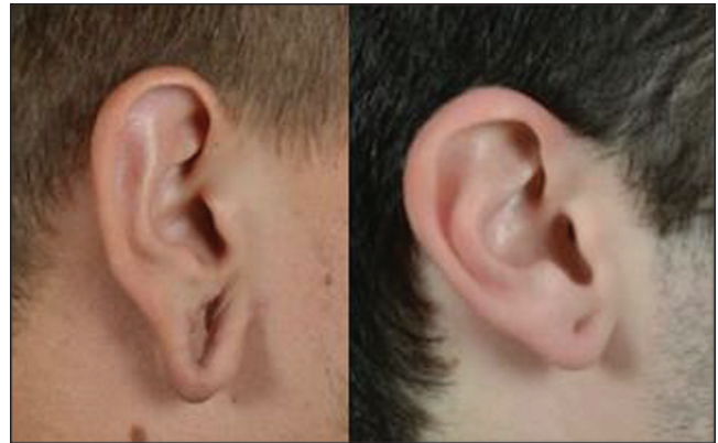
Figure 1: Left: Photo of a 22-year-old male with an unattached caudal segment that stretches below the natural contour of insertion. Right: Photo of a 19-year-old male with an unattached caudal segment that retains normal lobe contour

The natural configuration of the earlobe attachment to the face should be assessed to determine if it is attached (inserts on the face at a right or obtuse angle) or unattached (inserts on the face at an acute angle). The ideal earlobe measures less than 15mm from the tragal notch to the inferior attachment of the earlobe to the face (otobasion