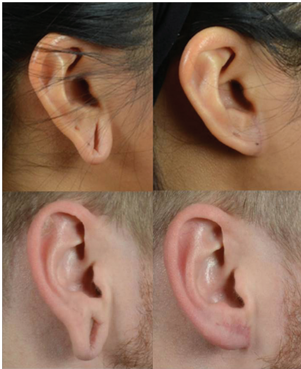
Figure 5: Top: Photo of a 25-year-old female before (left) and 19 days after (right) repair. Bottom: Photo of a 27-year-old-male before (left) and 48 days after (right) repair

Our study is limited by the relatively small sample size, which makes comparing the complication rate between the punch biopsy and the excision and rotation techniques challenging. We did not find a difference in complication