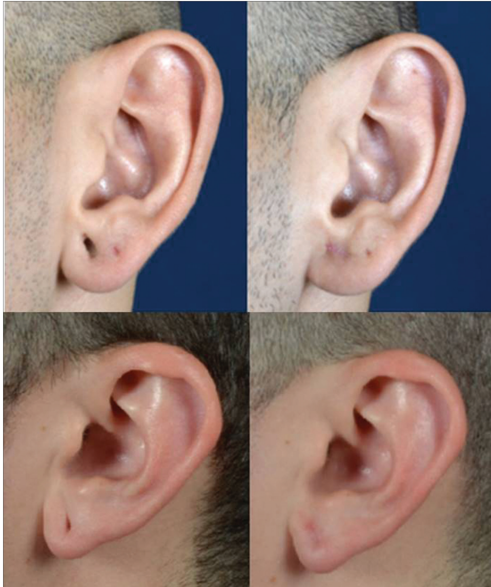
Figure 3: Top: Photos of a 33-year-old male before (left) and 14 days after (right) repair. Bottom: Photos of a 19-year-old male before (left) and 14 days after repair (right)

If the earlobe has become ptotic, skin excision and rotation is necessary to restore the natural shape of the earlobe. The skin is cleansed and local anesthetic is injected (1% lidocaine with epinephrine 1:100,000). The inferior portion of the caudal earlobe defect is divided. The incision is generally placed around the midpoint of