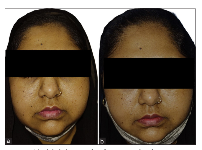
Figure 4: (a) Global photographs of patient 4 at baseline in group A, (b) global photographs of patient 4 at 2 months in group A.

in fragmentation of the target.4 It can remove the pigmented lesion without damaging the surrounding tissue, with the scab falling off by the 7th day of treatment.2