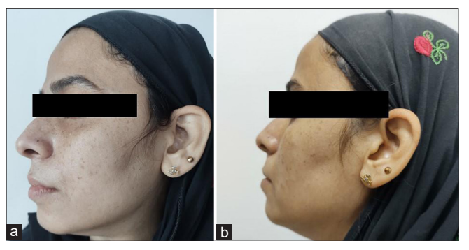
Figure 3: (a) Global photographs of patient 3 at baseline in group A, (b) global photographs of patient 3 at 2 months in group A.

The absorption spectrum of melanin is very broad, i.e., 400-1100 nm.5 Since many laser systems function in this visible and infrared range, all these lasers would have some effect on melanin. Green, red, and infrared wavelength bands are most useful for treating pigmented lesions.<sup>12</sup> In the past decade, Q-switched lasers have been developed (Q-switched ruby, Q-switched alexandrite, Q-switched Nd:YAG) to minimize damage to surrounding skin by continuous wave lasers.5 Continuous lasers or quasi-continuous lasers have an increased risk of scar formation, hypo, and hyperpigmentation.3 To overcome these problems, a dual-frequency (532/1064 nm) Q-switched Nd:YAG laser was developed, which induces both photothermal and photomechanical reactions.<sup>5</sup> It causes selective photothermolysis of melanosomes and melanin by producing higher temperature (1000°C) with short pulse duration (3-7 ns), resulting in evaporation of melanin within the skin and vacuolization. Between the target and surrounding tissue, a collapse of the temperature gradient is created, which leads to photomechanical damage resulting