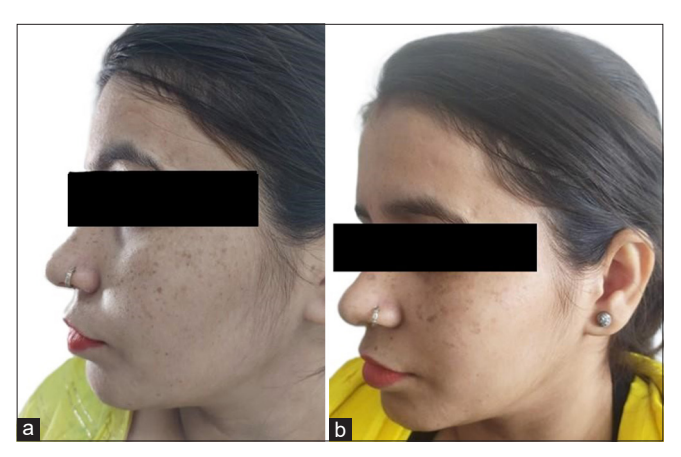
Figure 1: (a) Global photographs of patient 1 at baseline in group B, (b) global photographs of patient 1 at 2 months in group B.