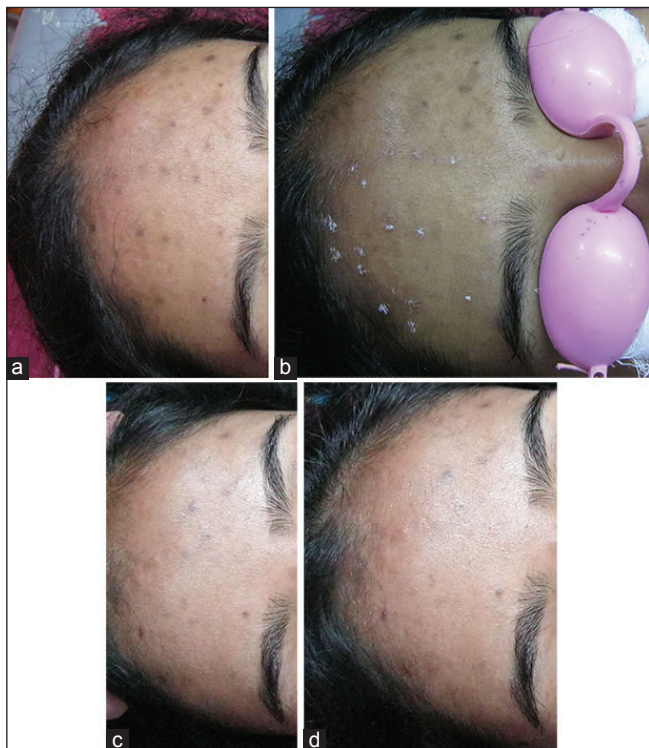
Figure 2: (a) Before treatment of hyperpigmentation on the forehead of a female patient (b) Treatment with QSNY laser (c) Good reduction of pigmentation after three sittings (d) Significant lightening after six sittings

scores revealed that 63/73 (86.7%) patients had good to excellent improvement while only 3/73 (4.1%) patients had hardly any or poor improvement. These values were found to be highly significant by paired t -test ( P < 0.001 ).