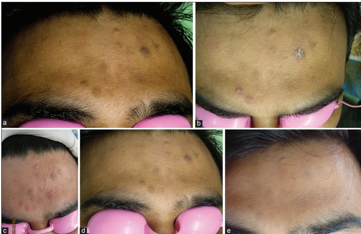
Figure 1: (a) Before treatment of hyperpigmentation on the forehead of a male patient (b) Treatment with QSNY laser (c) Edema and erythema after 10 min (d) Significant lightening of pigmentation after three sittings (e) Complete resolution after six sittings