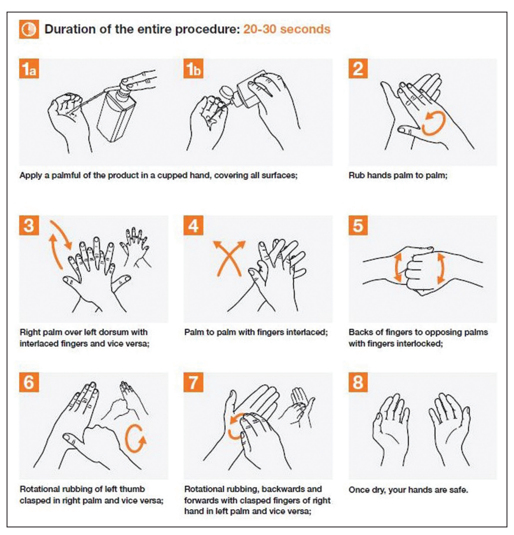
Figure 1: Hand sanitizing method with sanitizer. (Image adopted from https://www.who.int/gpsc/5may/hh-relay-procedure.pdf?ua=1)