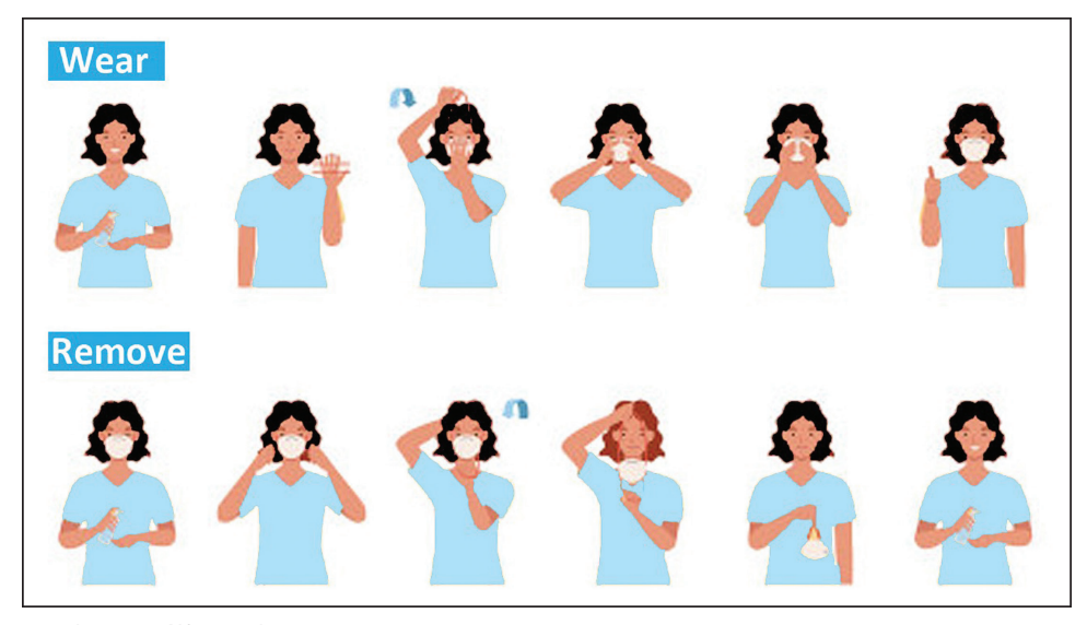
Figure 2: How to wear and remove N95 masks