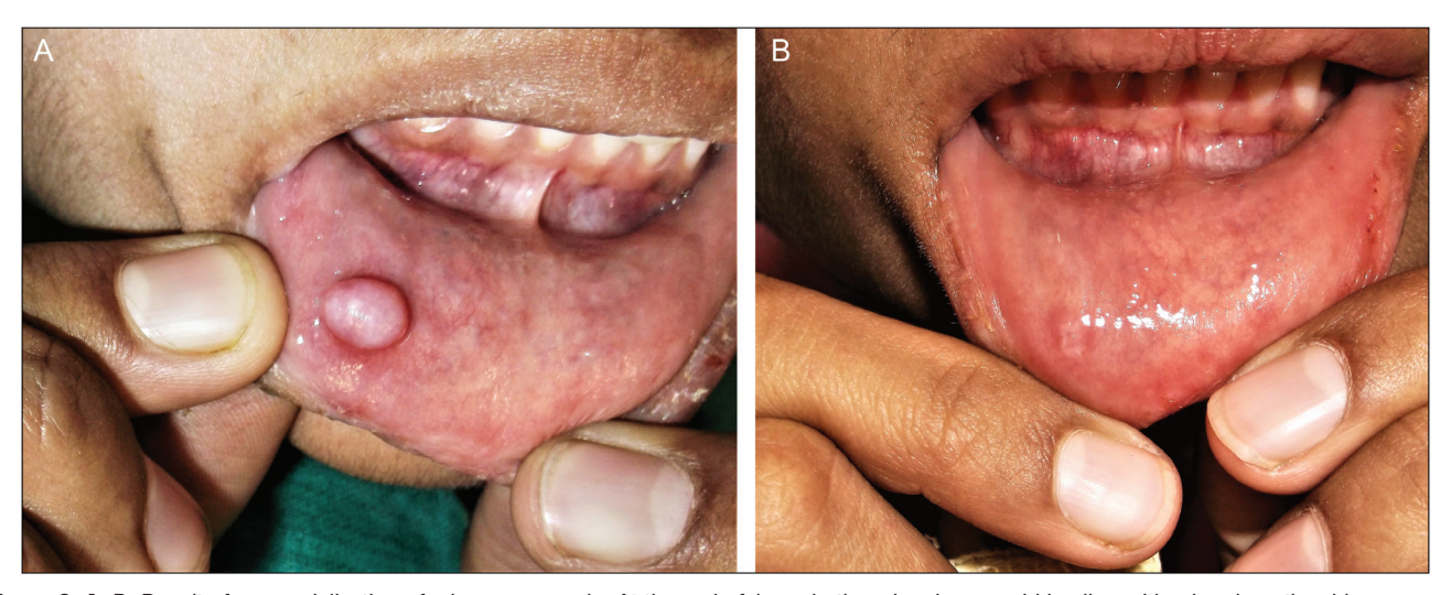
Figure 6: A, B: Result of marsupialization of a large mucocele. At the end of 1 week, there has been rapid healing with a barely noticeable scar