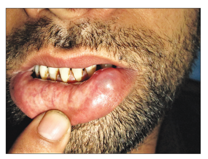
Figure 4: A large, superficial, bluish-colored mucocele causing a distortion in the lip structure