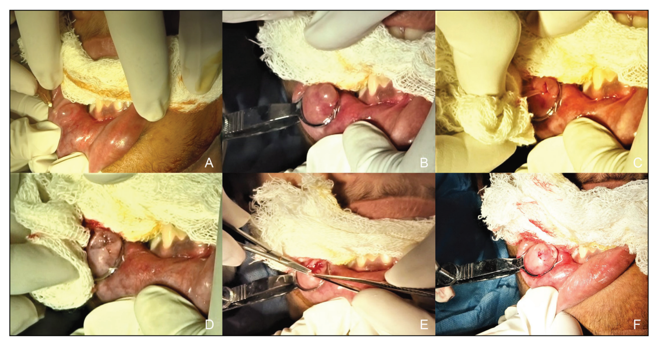
Figure 5: A-F: Marsupialization of a mucocele. (A) Local anesthesia with 2% lignocaine and adrenaline solution is injected around the lesion. (B) A chalazion clamp is applied to ensnare the lesion, enabling easier grip. (C) The first incision is made over the top of the cyst. Note the gelatinous material being extruded, which is removed. (D) The second incision is made perpendicular to the first one, making a cross. The contents of the mucocele are totally evacuated. (E) The four flaps of the roof of the mucocele are then excised with the help of a scissors. (F) Postremoval of flaps, it can be seen that the floor of the mucocele becomes a part of the floor of the labial mucosa. Only mild bleeding is seen from the edges, which can be easily controlled with pressure.

Various treatment modalities described in the literature include intralesional steroids (betamethasone or dexamethasone), sclerotherapy, ablation, or surgical removal. [5] Ablative therapy with laser or cryosurgery is useful for multiple lesions. [4] However, surgical removal is the most definitive and most commonly used treatment.