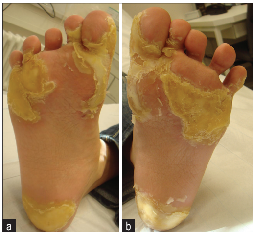
Figure 1: Painful callosities of the feet; (a) Right foot, (b) left foot

PCOF are very rare but severely disabling. Pain is preventing any normal biomechanics of feet and ankle making movements almost impossible. PCOF callosities can deprive children of physical activities, childhood experiences, and a healthy life style. There is no topical or systemic drug therapy available for cure. Oral retinoids do not decrease the pain, although they may reduce hyperkeratosis in inherited forms of