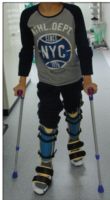
Figure 3: Almost normal and pain free gait with KOFA-orthosis 18 days after surgery

plantar hyperkeratosis (keratoderma). In the present case, however, they were of out of benefit. The disease affects normal physical development in children and adolescents and impairs psychological well being.