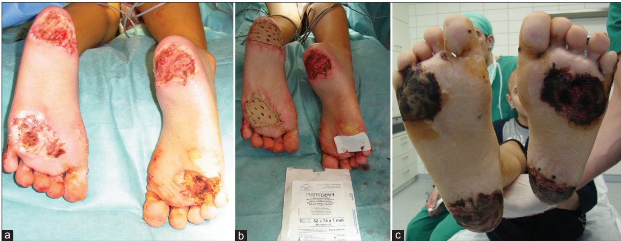
Figure 2: Surgery and sandwich transplantation. (a) Deep excision of plantar callosities. (b) Sandwich transplantation. (c) 18 days after transplantation