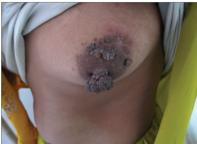
Figure 1: Left breast depicting hyperpigmented, warty papules, and growth involving the nipple and areola