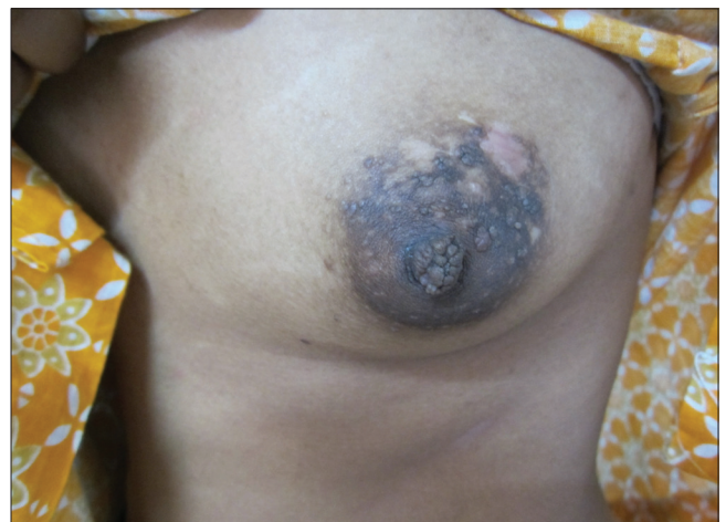
Figure 3: Postradiofrequency surgery follow-up illustrating healed lesions with some residual hypopigmentation and scarring with some smaller residual (left out) lesions in the vicinity