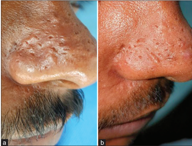
Figure 1: Result of radiofrequency epilation using acupuncture needles for papular acne scars in a patient with previous scarring due to syringe needle-based radiofrequency ablation. (a) Before and (b) after 1 session. No pigmentation or scarring was seen using thin acupuncture needles, in contrast with the previous session with syringe needle needle-based ablation.