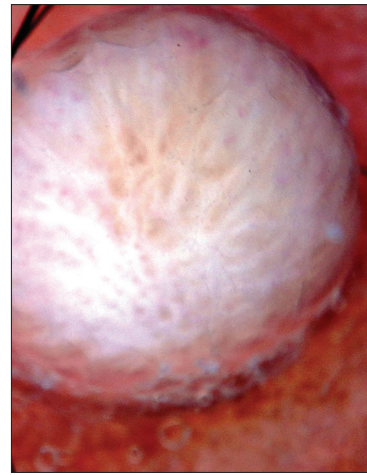
Figure 4: Dermoscopy under polarized light showing central pale area indicative of increased fibrocollagenous tissue with peripheral scaling