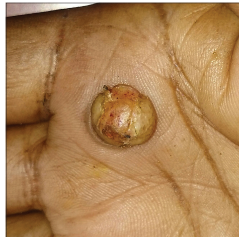
Figure 2: Close-up view of the lesion showing a nodule with a peripheral collarette of raised skin