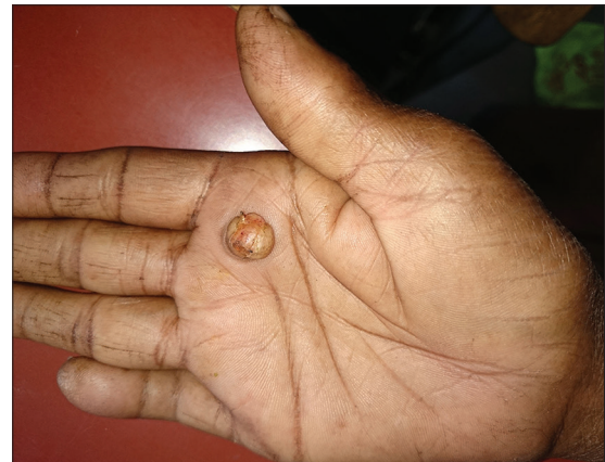
Figure 1: A 1 cm × 1 cm, dome shaped nodule near the base of index finger on right palm