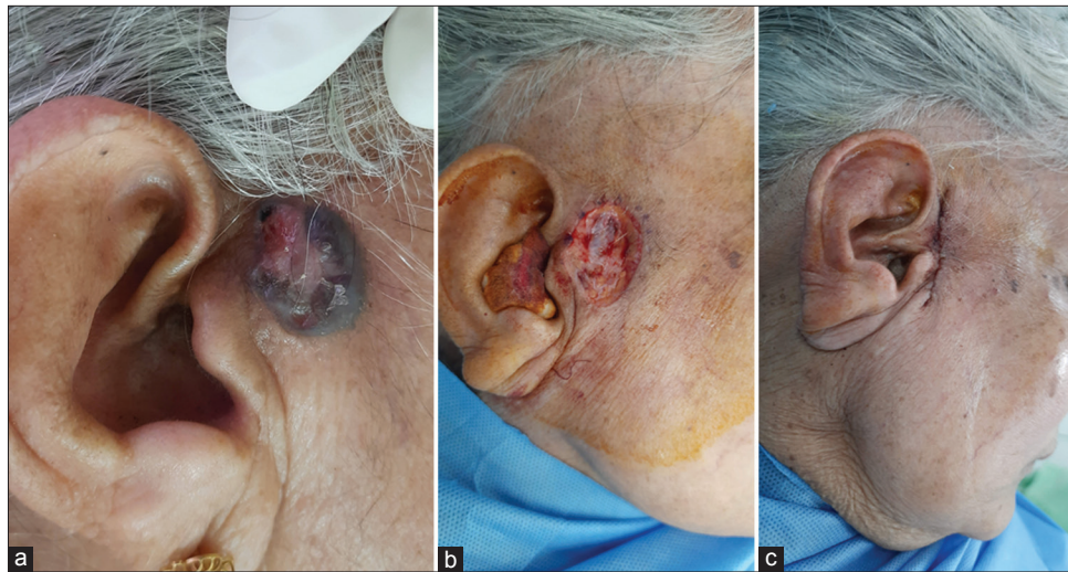
Figure 1: Case 1- (a) A pigmented noduloulcerative basal cell carcinoma, (b) intraoperative picture of case 1, and (c) post-operative closure without flap.

It was observed that Indian patients too presented with BCC, highlighting the need to bear in mind the possibility of BCC in patients of skin color. In cases that presented with recurrence