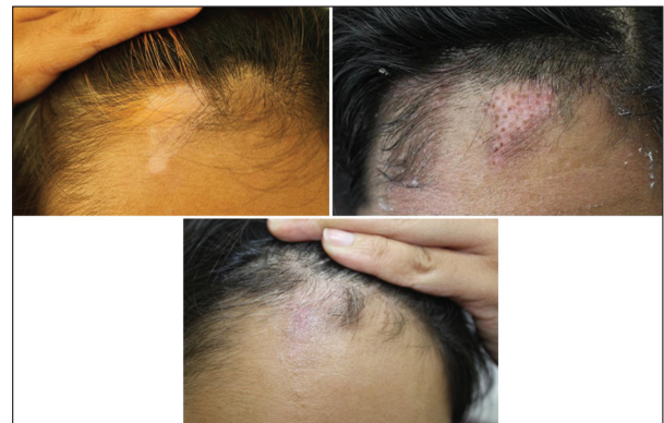
Figure 4: Shows pre-operative, post operative and follow up images

1.2 and 1.5 mm punches on recipient and donor sites, respectively, on the extremities.