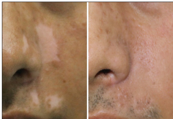
Figure 3: Shows pre-operative and post-operative (3 rd month) photographs