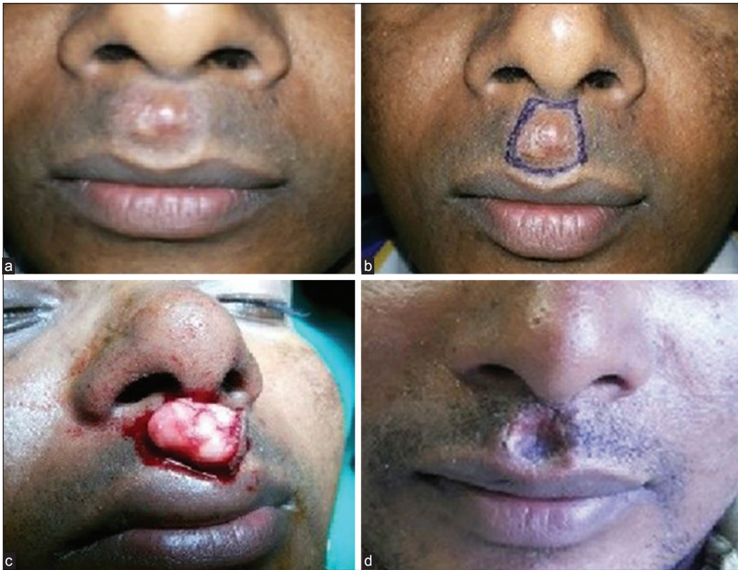
Figure 1: (a) Preoperative picture showing tumor of philtrum with involvement of skin (b) Planned excision of the tumor along with the skin (c) The excised tumor (d) Ten days postoperative picture of philtrum reconstructed with full-thickness skin graft