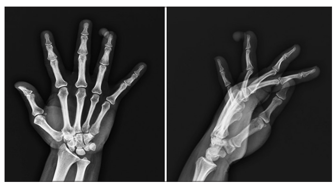
Figure 2: A plain X-ray (anterolateral and lateral views) of the left hand showed a well-defined soft tissue shadow around the tip of the ring finger without any connection with the distal phalynx