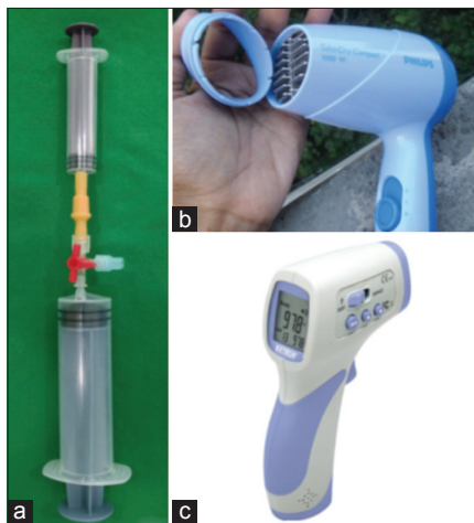
Figure 1: (a) Suction apparatus, (b) hair dryer, (c) infrared thermometer

Total seven patients with vitiligo involving both the angles of mouth and adjacent lower lip were studied [Table 1]. There were four females and three males. The mean age of patients was 23 \pm 4 years. The mean duration of disease was 3.4 \pm 1.5 years. Two patients had a family history of vitiligo. The mean time taken for formation of blister on the right thigh (without raising the surface temperature) was 121.1 \pm 6.2 min and the mean time taken for blister formation on the left thigh (surface temperature raised with the help of a hair dryer) was 69.6 \pm 5.4 min. The clinical pictures taken after 55 min showed partial blister formation on the right thigh whereas the left thigh showed well-formed, unilocular, dome-shaped blisters at the same time with few haemorrhagic blisters most likely due to heat-induced vasodilation [Figure 2]. The decrease in blister formation