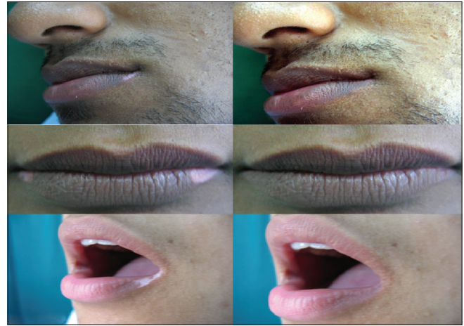
Figure 3: Baseline and follow-up pictures

Blister formation is more time-consuming and difficult in young patients as compared to the elderly patients because of weak dermoepidermal adherence in the latter. [12]