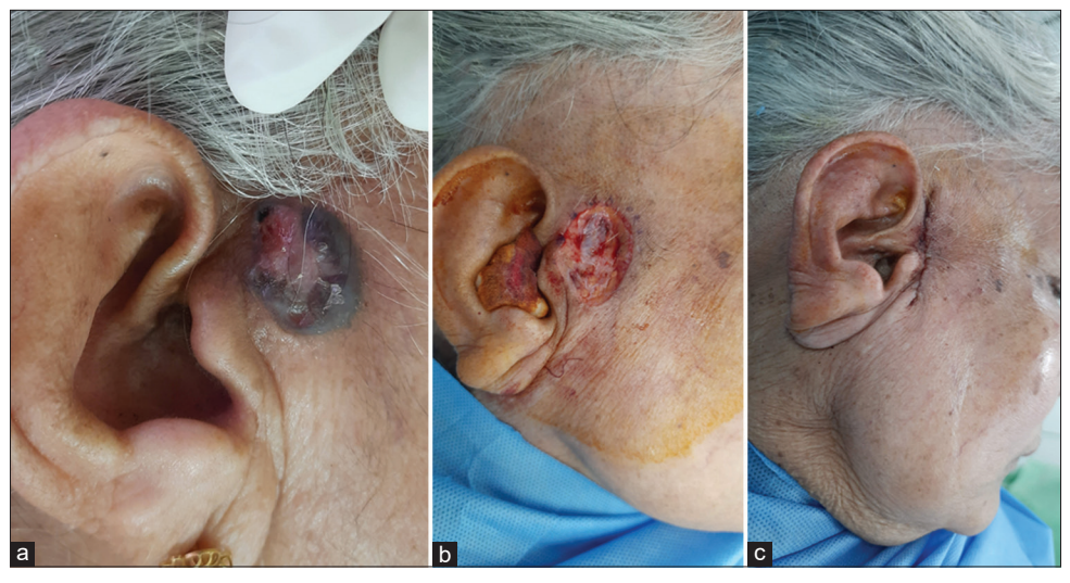
Figure 1: (a) Case 1- A pigmented noduloulcerative basal cell carcinoma, (b) intraoperative picture of case 1, and (c) post-operative closure without flap.

Despite limited infrastructure, with certain modifications, Mohs surgery was performed successively. No recurrences