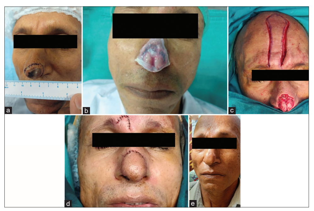
Figure 3: (a) Case 3-A recurrent pigmented noduloulcerative basal cell carcinoma on tip of the nose, (b) intraoperative picture of case 3 with collagen dressing, (c) paramedian forehead flap, (d) post-operative image, and (e) follow-up image in 2023 with no recurrence.

were reported, with the follow-up period being up to 5 years in some patients.