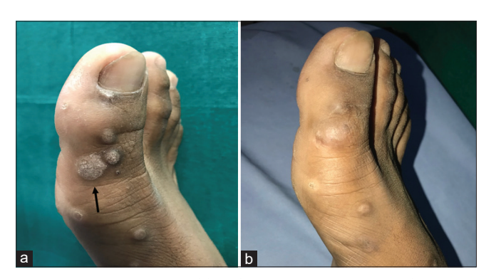
Figure 1: (a) A 35-year-old male patient presenting with verruca vulgaris on the dorsal aspect of right great toe. The target lesion is indicated by the black arrow. On the first session (week 0) of treatment with intralesional tuberculin purified protein derivative (PPD). (b) At 6 months follow-up, the warts showed a marked response to treatment with intralesional tuberculin PPD.