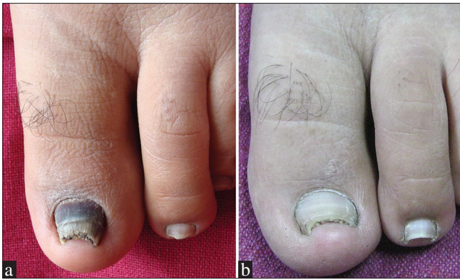
Figure 2: (a) Distal subungual onychomycosis of toenail. (b) Clearance of onychomycosis after 3 sessions of Q-switched neodymium-doped yttrium aluminum garnet laser

The exact mechanism of laser therapy is still under investigation, but it may combine direct fungicidal effects of the laser with induced modifications in the immune system or changes in the local microenvironment. [6]