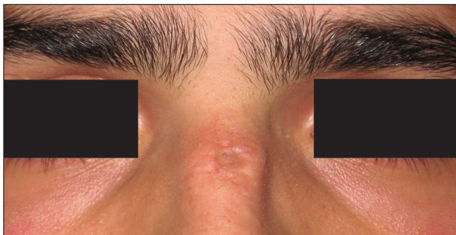
Figure 1: A 21-year-old male admitted to our clinic with a chronic exudative ulcer at the bridge of the nose

The patient images in Figures 1 to 3 were not published correctly. The correct patient images in the article should be as follows: