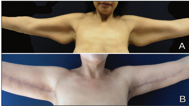
Figure 3: (A) Anterior view of a 38-year-old woman who underwent liposuction-assisted brachioplasty after gastric bypass and weight loss of 54 kg. (B) Six months postoperatively. Skin excess had been removed and the arm contour was aesthetically pleasing

Most patients were satisfied after surgery: in the standard technique group, 50% of the patients expressed a high degree of satisfaction, 25% a good degree, 5% a sufficient degree, and 25% an insufficient degree because of bad scars. In the LAB group, 81.8% of the patients expressed a high degree of satisfaction and 18.2% a good degree of satisfaction; no patient was dissatisfied. Patients' data are reported [Tables 1-4].