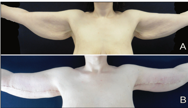
Figure 4: (A) Anterior views of a 29-year-old woman who underwent liposuction-assisted brachioplasty after sleeve gastrectomy and weight loss of 59 kg. (B) Six months postoperatively. Note the location and the quality of the scar