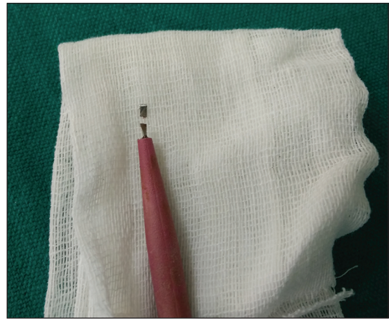
Figure 2: Broken distal piece of the blade and handle of the disposable Kolkata slit instrument

Disposable slits are less sturdy and one must be alert about choosing instruments of good quality. We haven't experienced a similar complication in the past nor have we found it in the data published. [2] Thus, we wanted to report this to alert other hair transplant surgeons regarding the possibility of such a complication and the necessity of using high quality surgical instruments.