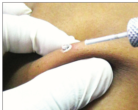
Figure 2: First freeze cycle after firmly clinching the base of skin with liquid nitrogen spray directed to clasped mouthparts of the tick at the site of tick adherence

The previously flat and horizontally engorged tick became vertical [Figure 3]. This was due to transient spasmodic movements of its trunk posteriorly with its clasp not released anteriorly. After 3 min of thawing, we executed a second cycle of 15 s of freezing to the top position of the mouthparts [Figure 4]. After another 3 min of thawing, the tick spontaneously released its clasps and was removed in toto . The site became ulcerated [Figure 5]. Under 10× microscopy, we visualized its mouthparts and confirmed