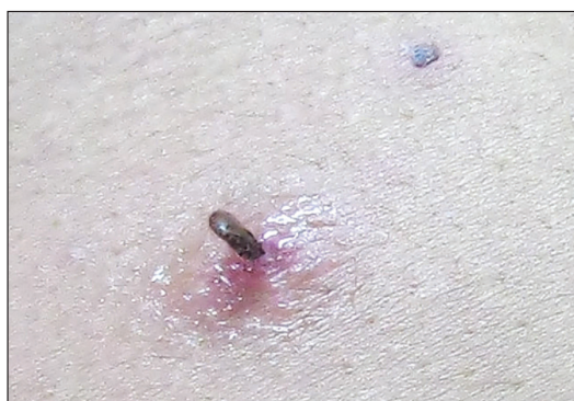
Figure 3: The previously flat and horizontally engorged tick moved into a vertical position after the first cycle of 15 s of freeze