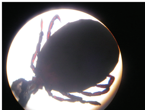
Figure 6: Tick mounted on light microscope (10×)