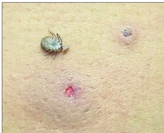
Figure 5: Prompt and complete removal of the tick after 3 min of the second cycle. The site became ulcerated

The previously flat and horizontally engorged tick became vertical [Figure 3]. This was due to transient spasmodic movements of its trunk posteriorly with its clasp not released anteriorly. After 3 min of thawing, we executed a second cycle of 15 s of freezing to the top position of the mouthparts [Figure 4]. After another 3 min of thawing, the tick spontaneously released its clasps and was removed in toto . The site became ulcerated [Figure 5]. Under 10× microscopy, we visualized its mouthparts and confirmed