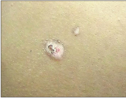
Figure 7: Appearance of the lesions 1 week after the procedure. The ulcer healed with transient depigmentation

that it was a hard tick [Figure 6]. We prescribed systemic azithromycin 500 mg twice daily for 3 days, systemic levocetirizine 5 mg daily for 7 days, and topical sodium fusidate ointment 2%. The site healed after 1 week [Figure 7].