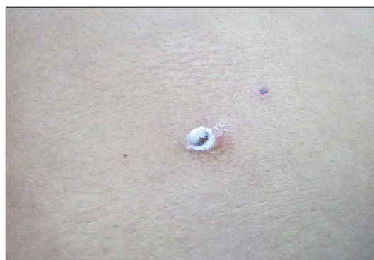
Figure 4: Freeze cycle repeated from the top