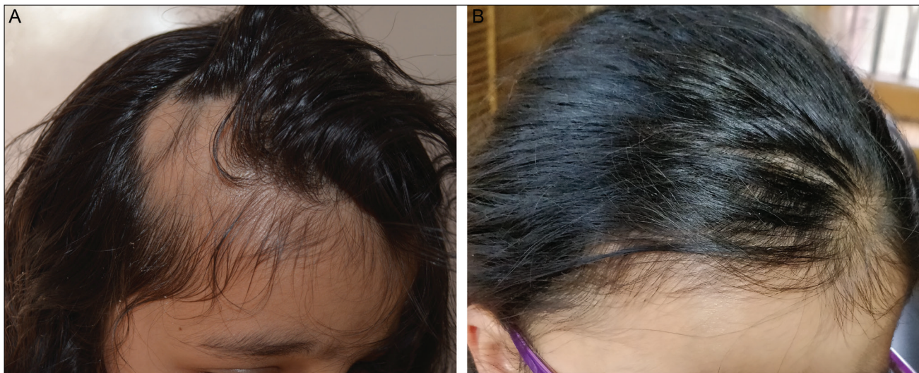
Figure 3: (A) Resistant alopecia areata in an 11-year-old female (Patient number 7). (B) Excellent response after treatment with fractional laser and steroid combination

case series. Both these mechanisms may be responsible for promoting hair regrowth in alopecia areata. [11]