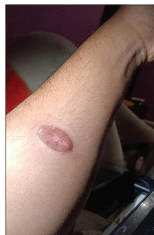
Figure 3: Wound healed with a hypertrophic scar by the end of 6 weeks.