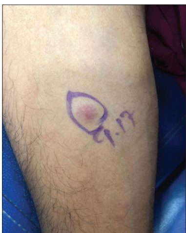
Figure 1: Soon after injecting formalin.

the medicines is mandatory for both, the surgeon as well as the assistant. 4 In dermatology, there are many colorless chemicals like normal saline, formalin, local anesthesia, hydrogen peroxide etc used simultaneously for different purposes. 1 Proper storage or labeling of these solutions would help avoid confusion and mishaps. Secondly, the practice of reusing empty local anesthetic vials for storage of biopsy specimens instead of separately labeled biopsy bottles is another reason for such accidents. 3 To avoid this, it is advisable to keep the non-injectable solutions away from the core clinical area. A similar case was reported by Bector A et al wherein formalin was accidentally injected in the oral cavity while performing a dental extraction, which resulted in chemical facial cellulitis. 5 Lastly, like they say, mistakes