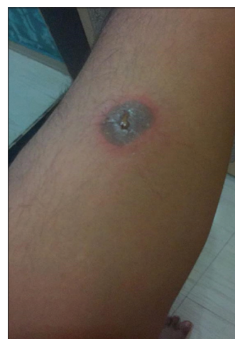
Figure 2: Day 2. The patient presented with a blister surrounded by bluish discoloration and an erythematous border.