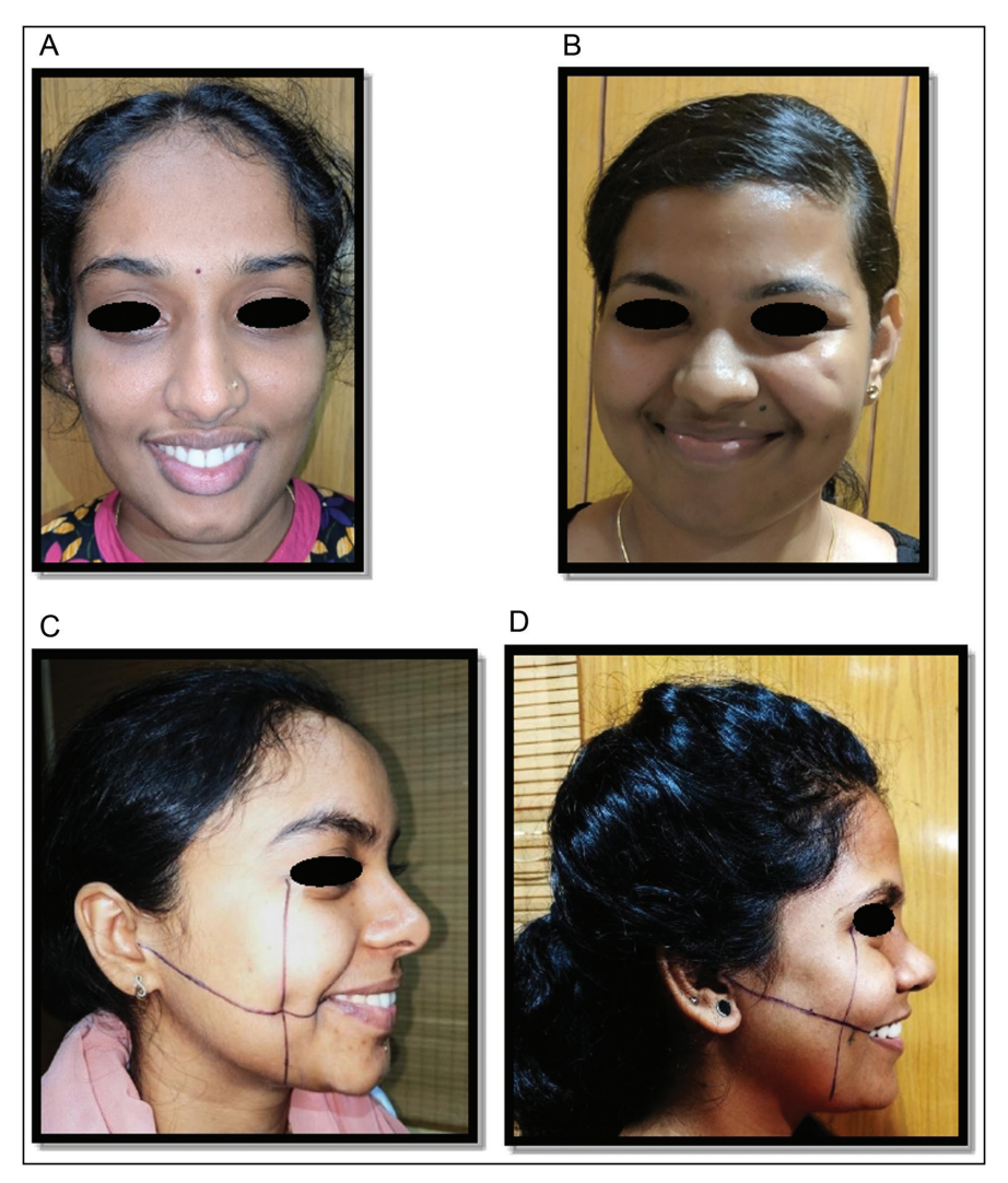
Figure 2: Variations in dimple: (A) chin dimple, (B) malar dimple, (c) dimple coinciding with KBC point, and (D) dimple not coinciding with KBC point