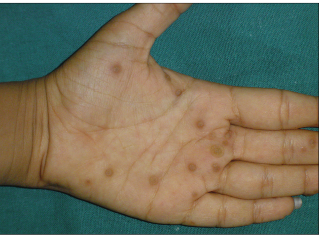
Figure 2: Multiple palmar warts before the initiation of treatment